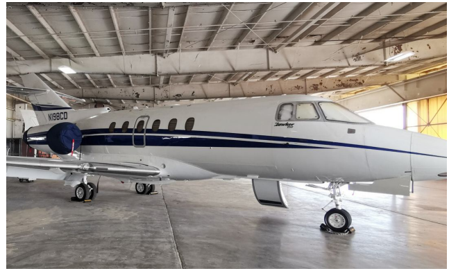
Hawker 750 HeatShields & Engine Covers