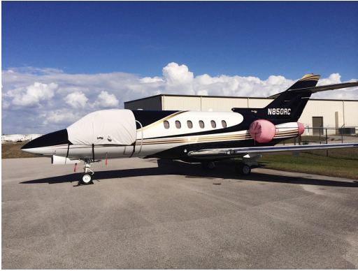
Hawker 800 Cockpit Cover, extended aft 24"

This cover type is made from Silver Acrylic Sunbrella canvas and is 100% lined with a soft and smooth microfiber. Bruce's Custom Covers developed this material combination especially for aircraft protection. The outer material is medium weight and treated for water resistance, UV resistance and anti-static buildup. The inner lining is a very soft and smooth microfiber to prevent scratching. The material is very reflective, and tests show that the cabin interior temperature can be reduced to near-ambient temperature on the hottest of days. It is water, ice and snow repellent, yet breathable to allow moisture to escape from between the cover and the aircraft surface.