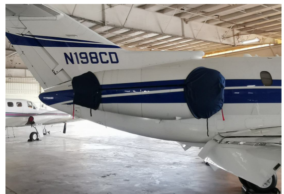
Hawker 750 Engine Covers