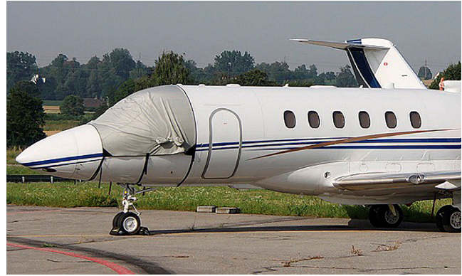
Hawker 800 Cockpit Cover