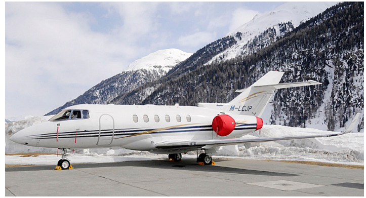
Hawker 900XP Engine & Pitot Cover set