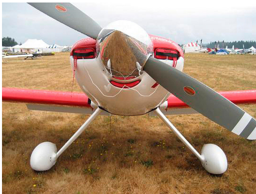
Harmon Rocket Engine Inlet Plugs

Engine Inlet Plugs are custom fit for your Harmon Rocket intakes, made with heavy-duty vinyl material, and stuffed with a single block of sculpted urethane foam. Each plug has a zipper that allows the foam to be removed and dried if necessary. Engine plugs have warning flags that are visible from the cockpit or 'remove before flight' streamers sewn onto the face of the plugs. Most plugs are imprinted with the aircraft registration number in black for an extra charge. Storage bag NOT included. Engine plugs may be inserted after flight when the engine is still warm. Engine Inlet Plugs are commonly referred to as Cowl Plugs, Intake Plugs, Cowl Blocks, Engine Blocks, and Engine Bungs.