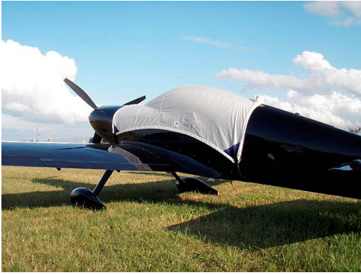
Harmon Rocket Canopy Cover

non-travel Sunbrella Cover is the best choice.