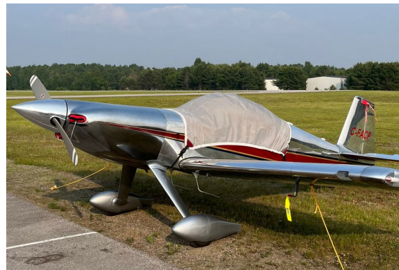
Harmon Rocket Travel Light Weight Canopy Cover Std Windshield