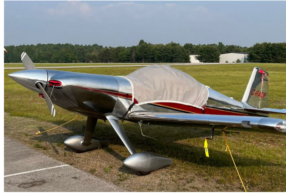
Harmon Rocket Travel Light Weight Canopy Cover Std Windshield