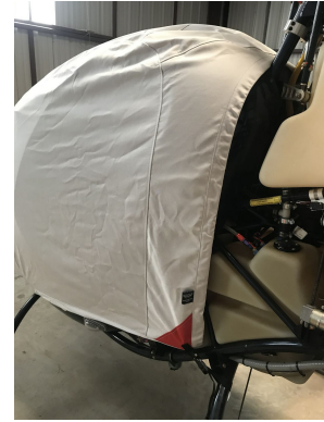
Helicycle Bubble Cover