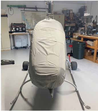
Eagle Helicycle Bubble Cover

and more compact for easy stowage in the aircraft. The polyester material is water resistant, but only intended for occasional use outside. We also have an ultra lightweight material available for fitted hangar dust covers. For daily outdoor use, the non-travel Sunbrella Cover is the best choice.