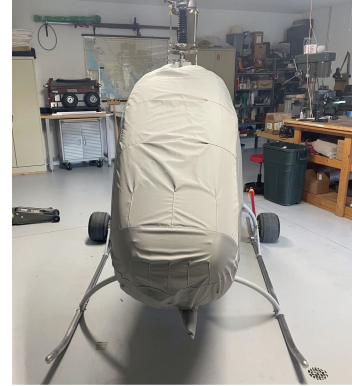
Eagle Helicycle Bubble Cover