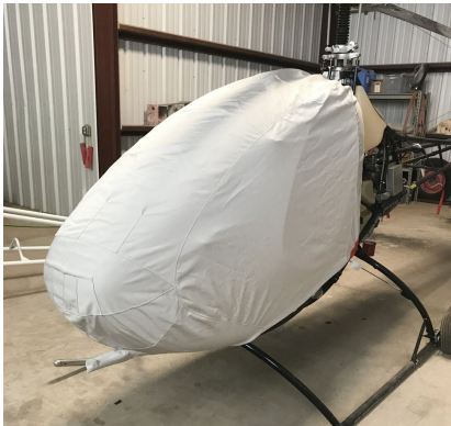
Helicycle Bubble Cover

This cover type is made from Silver Acrylic Sunbrella canvas and is 100% lined with a soft and smooth microfiber. Bruce's Custom Covers developed this material combination especially for aircraft protection. The outer material is medium weight and treated for water resistance, UV resistance and anti-static buildup. The inner lining is a very soft and smooth microfiber to prevent scratching. The material is very reflective, and tests show that the cabin interior temperature can be reduced to near-ambient temperature on the hottest of days. It is water, ice and snow repellent, yet breathable to allow moisture to escape from between the cover and the aircraft surface.