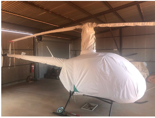
Robinson R-22 Full Cover Set