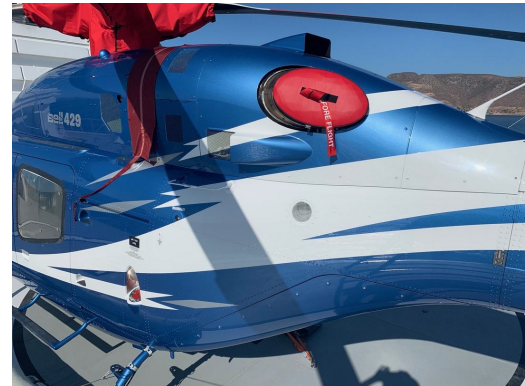
Bell 429 Exhaust Plug