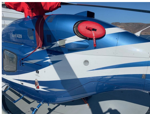
Bell 429 Exhaust Plug

The Engine Exhaust Plugs are custom fit for your Eagle R&D Helicycle exhaust openings, made with heavy-duty vinyl material, and stuffed with a single block of sculpted urethane foam. Exhaust plugs have 'Remove Before Flight' streamers sewn onto the face of the plugs. Exhaust plugs may be inserted soon after flight when the engine is still warm. Engine Inlet Plugs are commonly referred to as Cowl Plugs, Intake Plugs, Cowl Blocks, Engine Blocks, and Engine Bungs.