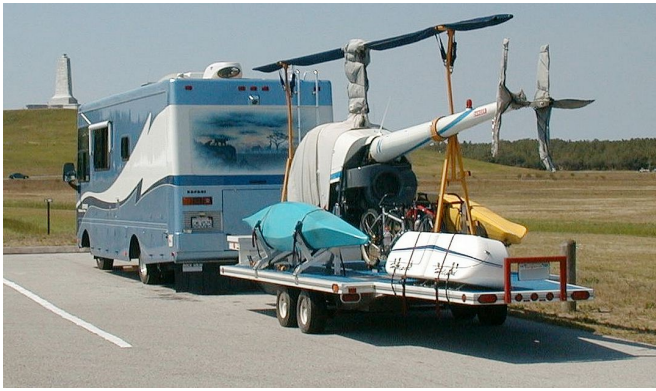
Robinson R-22 Bubble, Rotor Mast, Blades, Tail Rotor & Stabilizer Covers