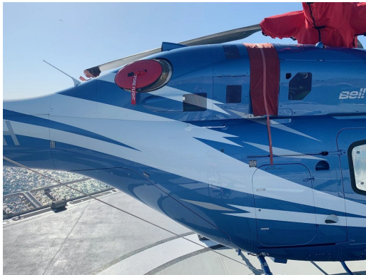
Bell 429 Exhaust Plug, Rotor Mast Cover

The Engine Exhaust Plugs are custom fit for your Eagle R&D Helicycle exhaust openings, made with heavy-duty vinyl material, and stuffed with a single block of sculpted urethane foam. Exhaust plugs have 'Remove Before Flight' streamers sewn onto the face of the plugs. Exhaust plugs may be inserted soon after flight when the engine is still warm. Engine Inlet Plugs are commonly referred to as Cowl Plugs, Intake Plugs, Cowl Blocks, Engine Blocks, and Engine Bungs.