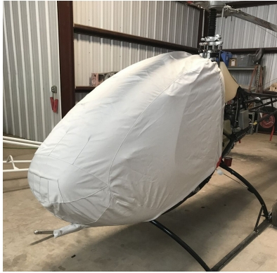
Helicycle Bubble Cover

This cover type is made from Silver Acrylic Sunbrella canvas and is 100% lined with a soft and smooth microfiber. Bruce's Custom Covers developed this material combination especially for aircraft protection. The outer material is medium weight and treated for water resistance, UV resistance and anti-static buildup. The inner lining is a very soft and smooth microfiber to prevent scratching. The material is very reflective, and tests show that the cabin interior temperature can be reduced to near-ambient temperature on the hottest of days. It is water, ice and snow repellent, yet breathable to allow moisture to escape from between the cover and the aircraft surface.