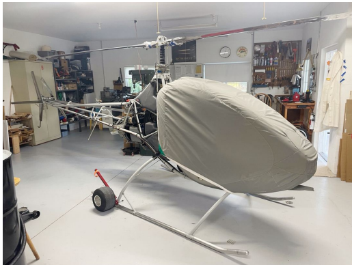
Eagle Helicycle Bubble Cover