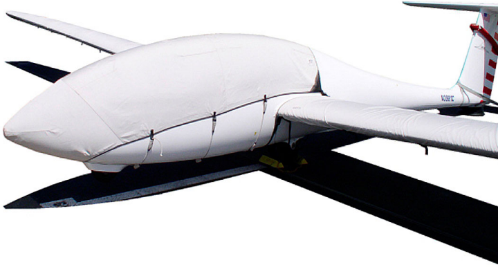
Grob 103 Canopy/Nose Cover and Wing Covers

This cover type is made from Silver Acrylic Sunbrella canvas and is 100% lined with a soft and smooth microfiber. Bruce's Custom Covers developed this material combination especially for aircraft protection. The outer material is medium weight and treated for water resistance, UV resistance and anti-static buildup. The inner lining is a very soft and smooth microfiber to prevent scratching. The material is very reflective, and tests show that the cabin interior temperature can be reduced to near-ambient temperature on the hottest of days. It is water, ice and snow repellent, yet breathable to allow moisture to escape from between the cover and the aircraft surface.