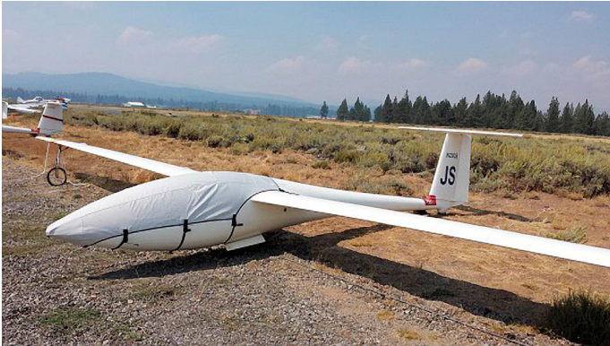
ASW-20C Canopy/Nose Cover

This cover type is made from Silver Acrylic Sunbrella canvas and is 100% lined with a soft and smooth microfiber. Bruce's Custom Covers developed this material combination especially for aircraft protection. The outer material is medium weight and treated for water resistance, UV resistance and anti-static buildup. The inner lining is a very soft and smooth microfiber to prevent scratching. The material is very reflective, and tests show that the cabin interior temperature can be reduced to near-ambient temperature on the hottest of days. It is water, ice and snow repellent, yet breathable to allow moisture to escape from between the cover and the aircraft surface.