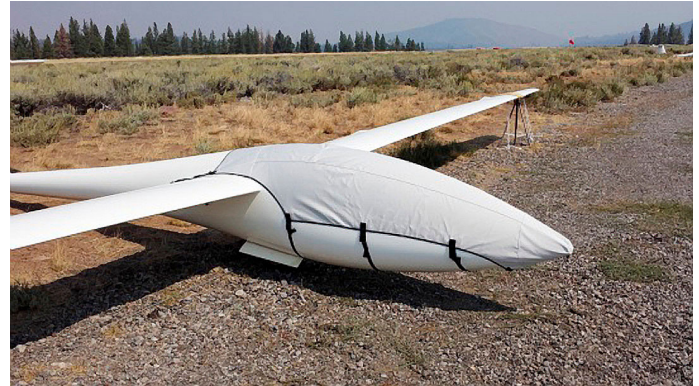
ASW-20C Canopy/Nose Cover