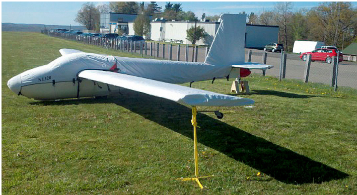
SGS 1-26B Canopy/Nose, Empennage & Wing Covers