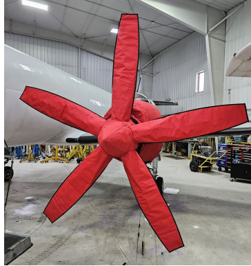
Fairchild Metro 5 Blade Insulated Insulated Prop Covers

The material is very reflective, and tests show that the cabin interior temperature can be reduced to near-ambient temperature on the hottest of days. It is water, ice and snow repellent, yet breathable to allow moisture to escape from between the cover and the aircraft surface.