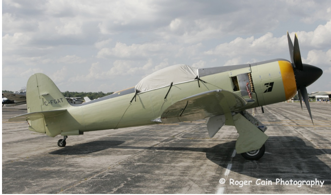
Hawker Sea Fury Canopy Cover

This cover type is made from Silver Acrylic Sunbrella canvas and is 100% lined with a soft and smooth microfiber. Bruce's Custom Covers developed this material combination especially for aircraft protection. The outer material is medium weight and treated for water resistance, UV resistance and anti-static buildup. The inner lining is a very soft and smooth microfiber to prevent scratching. The material is very reflective, and tests show that the cabin interior temperature can be reduced to near-ambient temperature on the hottest of days. It is water, ice and snow repellent, yet breathable to allow moisture to escape from between the cover and the aircraft surface.