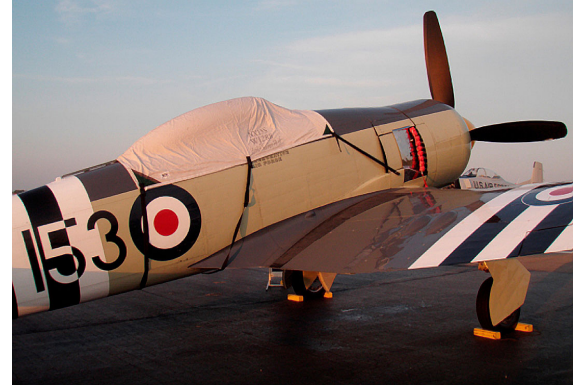
Sea Fury Canopy Cover & Exhaust Plugs