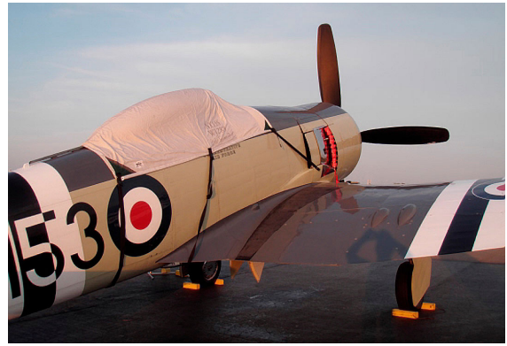
Sea Fury Canopy Cover & Exhaust Plugs