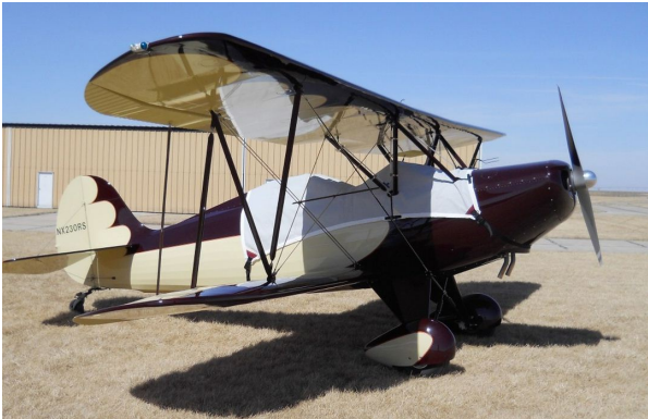
Hatz Biplane Canopy Cover

This cover type is made from Silver Acrylic Sunbrella canvas and is 100% lined with a soft and smooth microfiber. Bruce's Custom Covers developed this material combination especially for aircraft protection. The outer material is medium weight and treated for water resistance, UV resistance and anti-static buildup. The inner lining is a very soft and smooth microfiber to prevent scratching. The material is very reflective, and tests show that the cabin interior temperature can be reduced to near-ambient temperature on the hottest of days. It is water, ice and snow repellent, yet breathable to allow moisture to escape from between the cover and the aircraft surface.