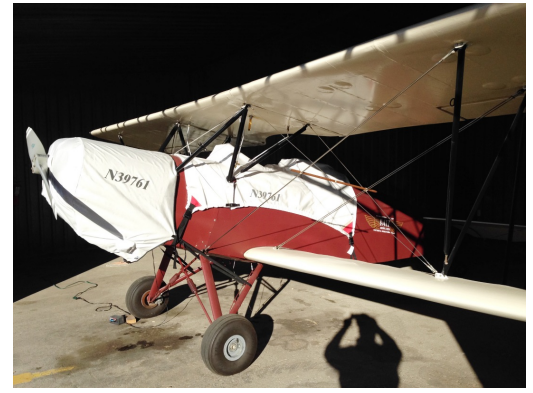
Hatz Biplane Canopy and Engine Covers