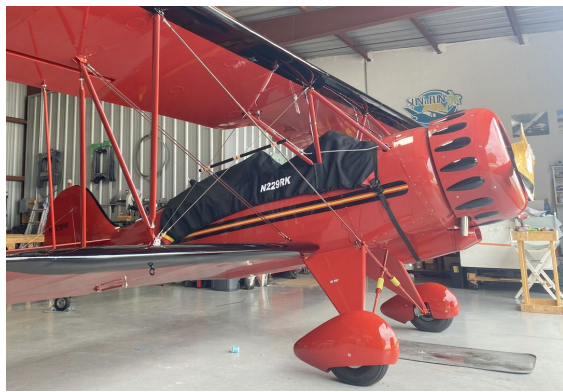
Biplane Hatz Classic Canopy Cover