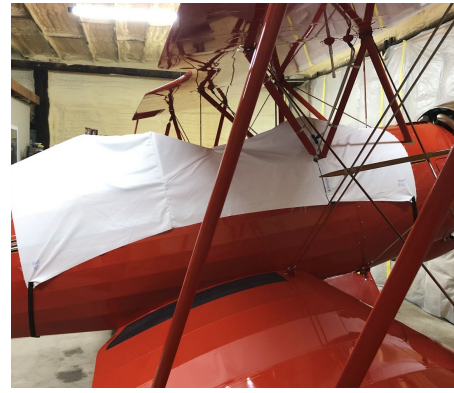
Hatz Biplane Canopy Cover, test fit cover