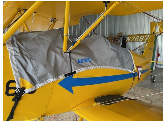
HATZ CB-1 Travel Cover, Light Weight Canopy Cover