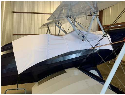
Hatz Biplane Canopy Cover, test fit cover