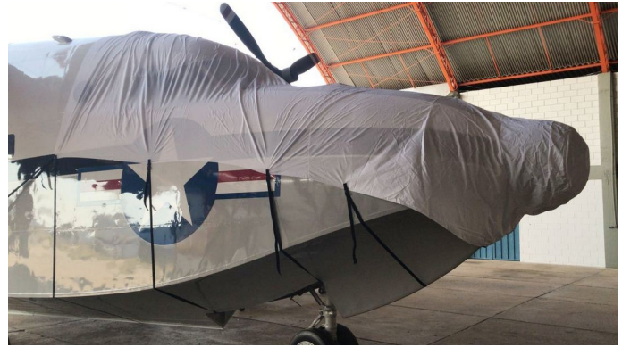
Grumman HU-16 Albatross Cockpit/Nose Cover (test fit cover)