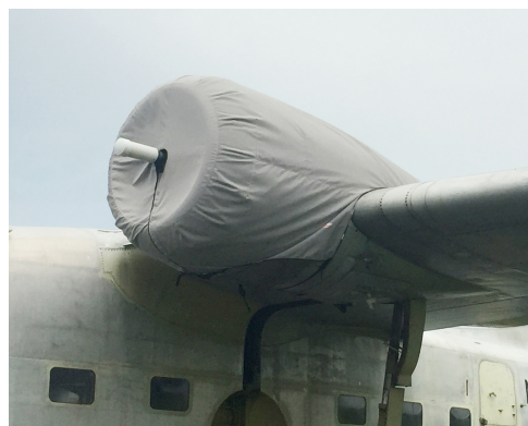
Grumman Albatross Engine Covers