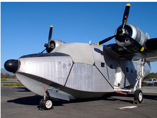
Canopy Cover for the Grumman HU-16 Albatross

This cover type is made from Silver Acrylic Sunbrella canvas and is 100% lined with a soft and smooth microfiber. Bruce's Custom Covers developed this material combination especially for aircraft protection. The outer material is medium weight and treated for water resistance, UV resistance and anti-static buildup. The inner lining is a very soft and smooth microfiber to prevent scratching. The material is very reflective, and tests show that the cabin interior temperature can be reduced to near-ambient temperature on the hottest of days. It is water, ice and snow repellent, yet breathable to allow moisture to escape from between the cover and the aircraft surface.