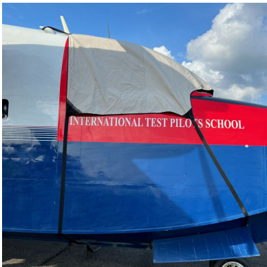
Grumman Albatross Cockpit Cover