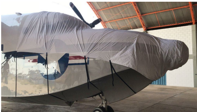
Grumman HU-16 Albatross Cockpit/Nose Cover (test fit cover)

This cover type is made from Silver Acrylic Sunbrella canvas and is 100% lined with a soft and smooth microfiber. Bruce's Custom Covers developed this material combination especially for aircraft protection. The outer material is medium weight and treated for water resistance, UV resistance and anti-static buildup. The inner lining is a very soft and smooth microfiber to prevent scratching. The material is very reflective, and tests show that the cabin interior temperature can be reduced to near-ambient temperature on the hottest of days. It is water, ice and snow repellent, yet breathable to allow moisture to escape from between the cover and the aircraft surface.