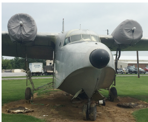
Grumman Albatross Engine Covers

This cover type is made from Silver Acrylic Sunbrella canvas and is 100% lined with a soft and smooth microfiber. Bruce's Custom Covers developed this material combination especially for aircraft protection. The outer material is medium weight and treated for water resistance, UV resistance and anti-static buildup. The inner lining is a very soft and smooth microfiber to prevent scratching. The material is very reflective, and tests show that the cabin interior temperature can be reduced to near-ambient temperature on the hottest of days. It is water, ice and snow repellent, yet breathable to allow moisture to escape from between the cover and the aircraft surface.