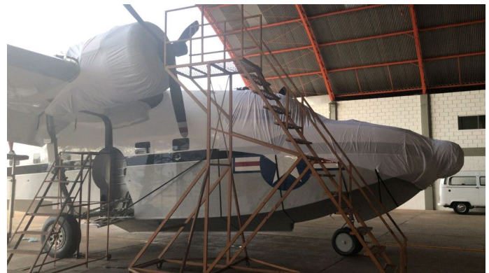
Grumman HU-16 Albatross Cockpit/Nose Cover and Engine Cover(test fit covers)