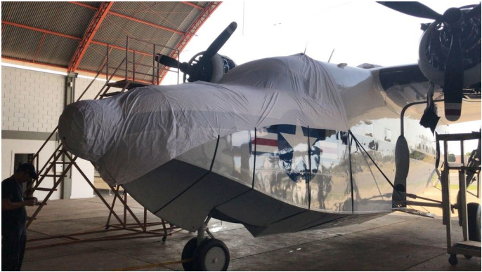
Grumman HU-16 Albatross Cockpit/Nose Cover (test fit cover)