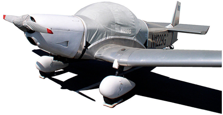
Zenith CH601 Canopy Cover & Prop Cover