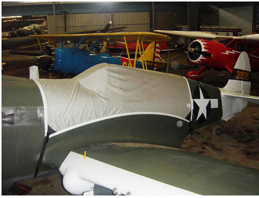
P40 Canopy Cover