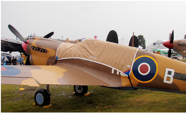
P40 Canopy Cover