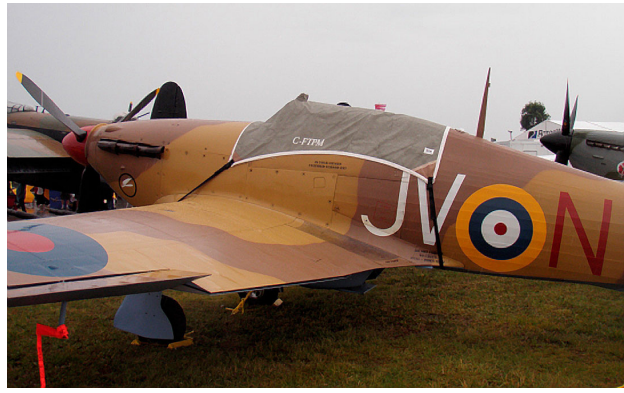
Hawker Hurricane Canopy Cover