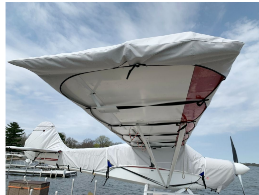
Aviat Husky Canopy, Engine, Wing, Empennage Covers