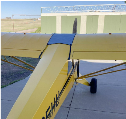
Aviat Husky Windshield/Skylight Cover

This cover type is made from Silver Acrylic Sunbrella canvas and is 100% lined with a soft and smooth microfiber. Bruce's Custom Covers developed this material combination especially for aircraft protection. The outer material is medium weight and treated for water resistance, UV resistance and anti-static buildup. The inner lining is a very soft and smooth microfiber to prevent scratching. The material is very reflective, and tests show that the cabin interior temperature can be reduced to near-ambient temperature on the hottest of days. It is water, ice and snow repellent, yet breathable to allow moisture to escape from between the cover and the aircraft surface.