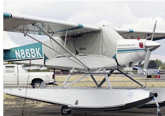
Aviat Husky Canopy Cover and Inlet Plugs