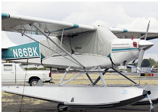
Aviat Husky Canopy Cover and Inlet Plugs

Engine Inlet Plugs are custom fit for your Aviat (Christen) Husky intakes, made with heavy-duty vinyl material, and stuffed with a single block of sculpted urethane foam. Each plug has a zipper that allows the foam to be removed and dried if necessary. Engine plugs have warning flags that are visible from the cockpit or 'remove before flight' streamers sewn onto the face of the plugs. Most plugs are imprinted with the aircraft registration number in black for an extra charge. Storage bag NOT included. Engine plugs may be inserted after flight when the engine is still warm. Engine Inlet Plugs are commonly referred to as Cowl Plugs, Intake Plugs, Cowl Blocks, Engine Blocks, and Engine Bungs.