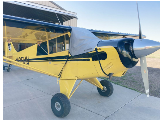
Aviat Husky Windshield/Skylight Cover