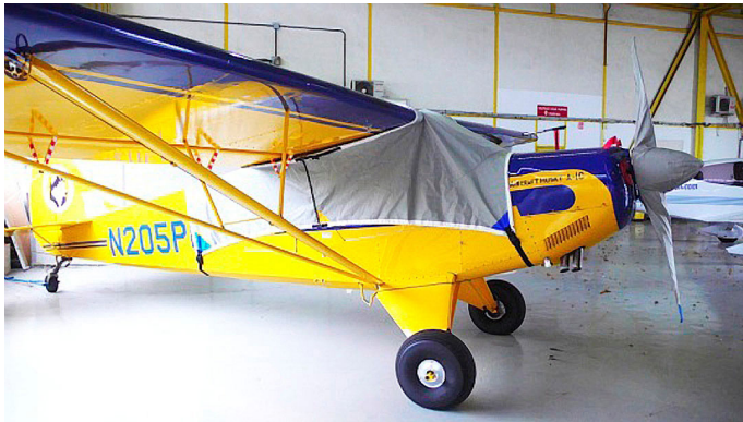
Aviat Husky Canopy & Prop Covers

This cover type is made from Silver Acrylic Sunbrella canvas and is 100% lined with a soft and smooth microfiber. Bruce's Custom Covers developed this material combination especially for aircraft protection. The outer material is medium weight and treated for water resistance, UV resistance and anti-static buildup. The inner lining is a very soft and smooth microfiber to prevent scratching. The material is very reflective, and tests show that the cabin interior temperature can be reduced to near-ambient temperature on the hottest of days. It is water, ice and snow repellent, yet breathable to allow moisture to escape from between the cover and the aircraft surface.