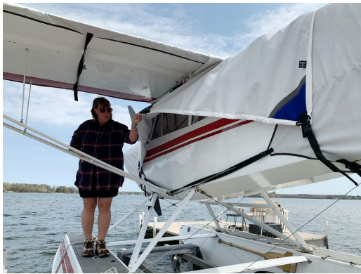
Aviat Husky Canopy, Wing, Empennage Covers

WINTER USE MATERIAL - Made with Solution-Dyed Polyester fabric, this option is intended for seasonal use to aid in deicing, rain mitigation, or for occasional travel. The material is lighter and more compact, but more susceptible to UV damage and may have a shorter useful life if used continuously outside than the all-year use material.