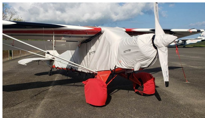
Aviat Husky Extended Canopy Cover, Engine, Prop, Empennage & Tire Covers