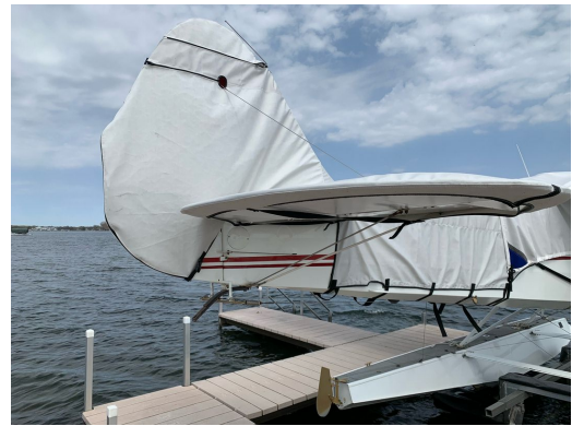
Aviat Husky Empennage Cover