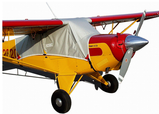
Aviat Husky Canopy Cover & Engine Plugs