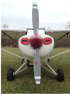
Aviat Husky Engine Plugs, Wing Covers

WINTER USE MATERIAL - Made with Solution-Dyed Polyester fabric, this option is intended for seasonal use to aid in deicing, rain mitigation, or for occasional travel. The material is lighter and more compact, but more susceptible to UV damage and may have a shorter useful life if used continuously outside than the all-year use material.