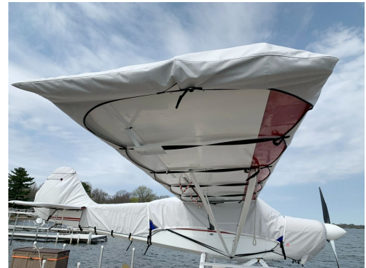
Aviat Husky Canopy, Engine, Wing, Empennage Covers