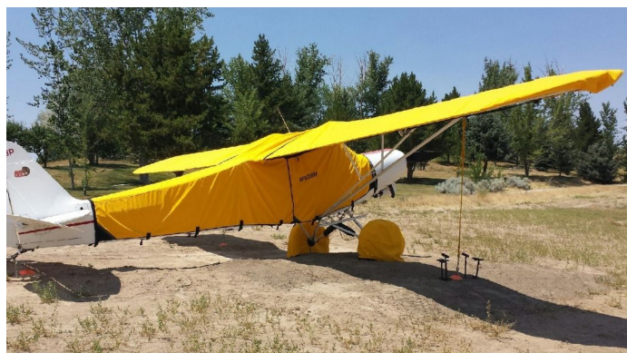
Piper PA-18 Super Cub Extended Canopy Cover, Wing & Tire Covers

WINTER USE MATERIAL - Made with Solution-Dyed Polyester fabric, this option is intended for seasonal use to aid in deicing, rain mitigation, or for occasional travel. The material is lighter and more compact, but more susceptible to UV damage and may have a shorter useful life if used continuously outside than the all-year use material.