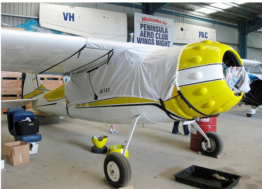
Cessna 195 Canopy Cover, over-top, 24" fwd ext to cover cowl ring gap, gas cap ext.