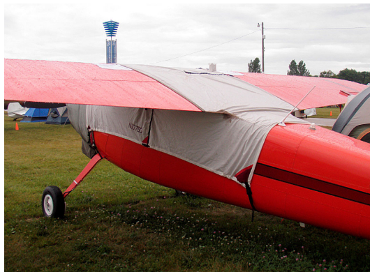
Over-Top Canopy Cover & Engine Cover

This cover type is made from Silver Acrylic Sunbrella canvas and is 100% lined with a soft and smooth microfiber. Bruce's Custom Covers developed this material combination especially for aircraft protection. The outer material is medium weight and treated for water resistance, UV resistance and anti-static buildup. The inner lining is a very soft and smooth microfiber to prevent scratching. The material is very reflective, and tests show that the cabin interior temperature can be reduced to near-ambient temperature on the hottest of days. It is water, ice and snow repellent, yet breathable to allow moisture to escape from between the cover and the aircraft surface.