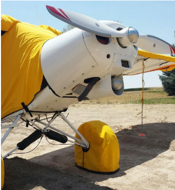
Cub Crafters CC19 Oversize Tire Covers, test fit cover Piper PA-18 Super Cub Extended Canopy Cover, Wing & Tire Covers