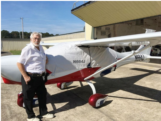
Jabiru 230SP Canopy Cover, Over-Top Style

This cover type is made from Silver Acrylic Sunbrella canvas and is 100% lined with a soft and smooth microfiber. Bruce's Custom Covers developed this material combination especially for aircraft protection. The outer material is medium weight and treated for water resistance, UV resistance and anti-static buildup. The inner lining is a very soft and smooth microfiber to prevent scratching. The material is very reflective, and tests show that the cabin interior temperature can be reduced to near-ambient temperature on the hottest of days. It is water, ice and snow repellent, yet breathable to allow moisture to escape from between the cover and the aircraft surface.