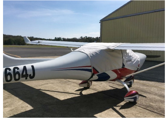
Jabiru J230-SP Canopy Cover, Over-Top Style