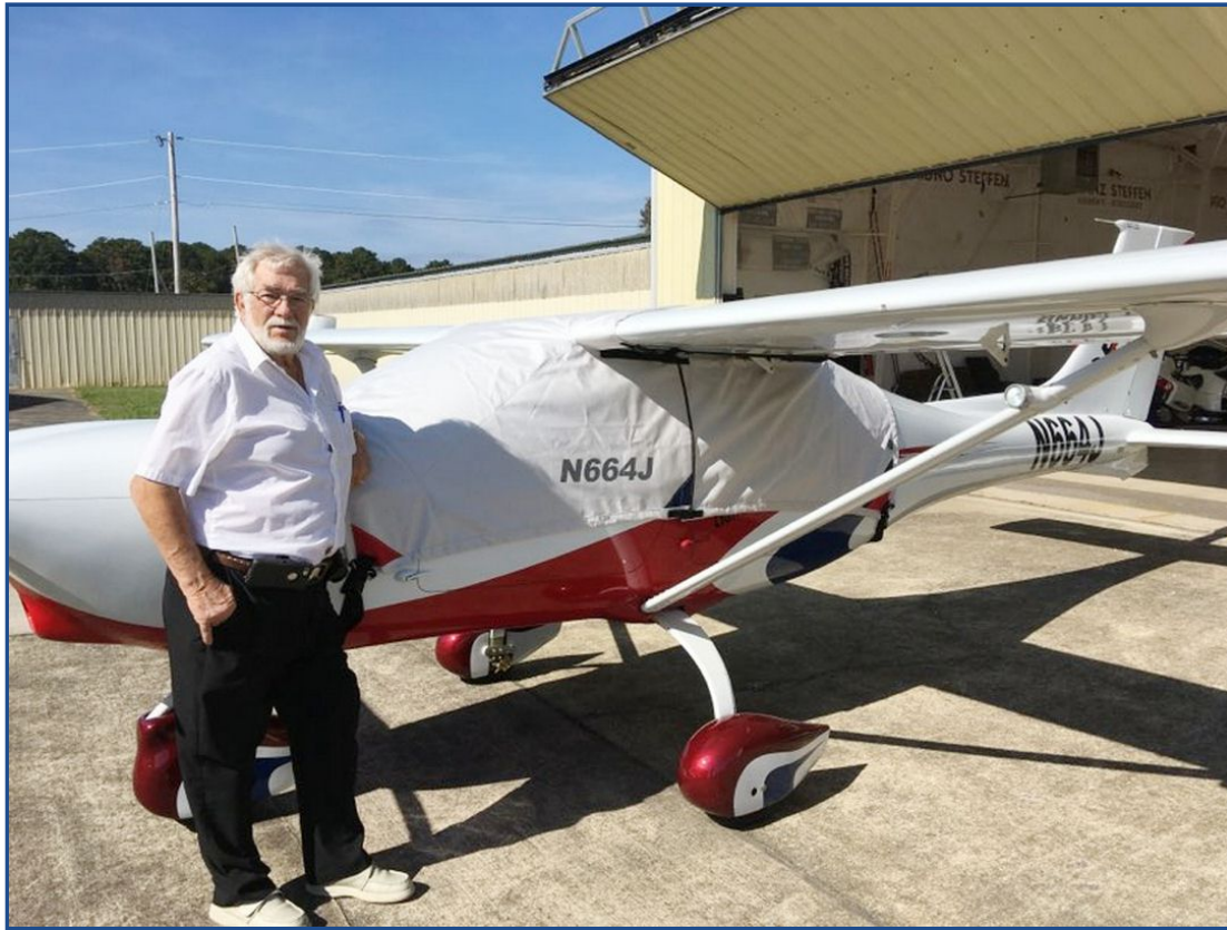
Jabiru 230SP Canopy Cover, Over-Top Style