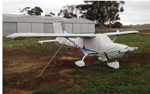
Jabiru 160 Canopy, Engine, Prop, Wings & Empennage Covers