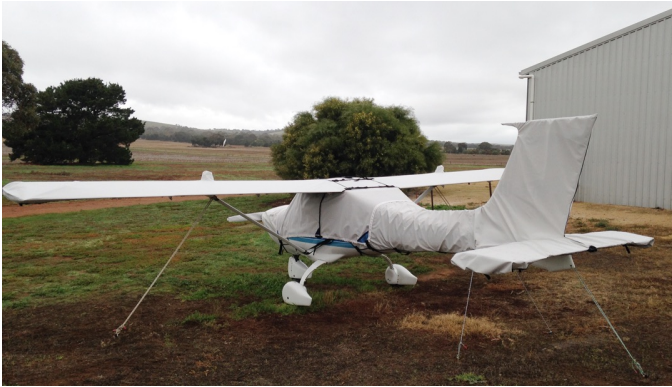
Jabiru 160 Canopy, Engine, Prop, Wings & Empennage Covers

This cover type is made from Silver Acrylic Sunbrella canvas and is 100% lined with a soft and smooth microfiber. Bruce's Custom Covers developed this material combination especially for aircraft protection. The outer material is medium weight and treated for water resistance, UV resistance and anti-static buildup. The inner lining is a very soft and smooth microfiber to prevent scratching. The material is very reflective, and tests show that the cabin interior temperature can be reduced to near-ambient temperature on the hottest of days. It is water, ice and snow repellent, yet breathable to allow moisture to escape from between the cover and the aircraft surface.