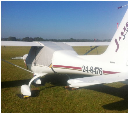
Jabiru 170 Canopy Cover

This cover type is made from Silver Acrylic Sunbrella canvas and is 100% lined with a soft and smooth microfiber. Bruce's Custom Covers developed this material combination especially for aircraft protection. The outer material is medium weight and treated for water resistance, UV resistance and anti-static buildup. The inner lining is a very soft and smooth microfiber to prevent scratching. The material is very reflective, and tests show that the cabin interior temperature can be reduced to near-ambient temperature on the hottest of days. It is water, ice and snow repellent, yet breathable to allow moisture to escape from between the cover and the aircraft surface.