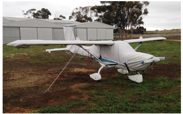
Jabiru 160 Canopy, Engine, Prop, Wings & Empennage Covers