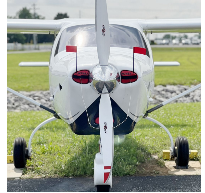
ENGINE PLUGS PREVENT BIRD NEST FOD. Piper Saratoga Engine Cowling Bird's Nest Jabiru J230-SP Engine Inlet Plugs