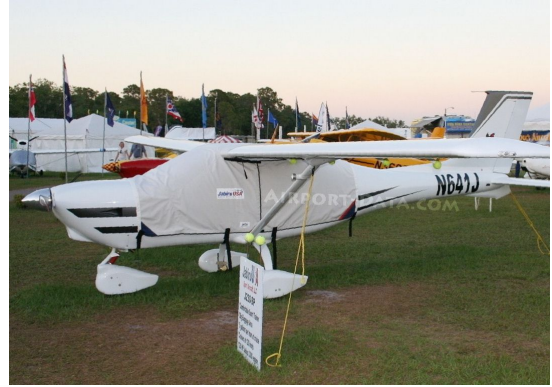
Jabiru J230 Canopy Cover