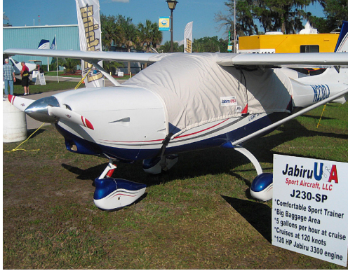
Jabiru 230-SP Canopy Cover, Over-top style

This cover type is made from Silver Acrylic Sunbrella canvas and is 100% lined with a soft and smooth microfiber. Bruce's Custom Covers developed this material combination especially for aircraft protection. The outer material is medium weight and treated for water resistance, UV resistance and anti-static buildup. The inner lining is a very soft and smooth microfiber to prevent scratching. The material is very reflective, and tests show that the cabin interior temperature can be reduced to near-ambient temperature on the hottest of days. It is water, ice and snow repellent, yet breathable to allow moisture to escape from between the cover and the aircraft surface.