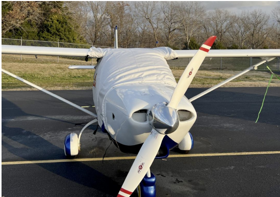
Jabiru J230-SP Extended Canopy Cover

This cover type is made from Silver Acrylic Sunbrella canvas and is 100% lined with a soft and smooth microfiber. Bruce's Custom Covers developed this material combination especially for aircraft protection. The outer material is medium weight and treated for water resistance, UV resistance and anti-static buildup. The inner lining is a very soft and smooth microfiber to prevent scratching. The material is very reflective, and tests show that the cabin interior temperature can be reduced to near-ambient temperature on the hottest of days. It is water, ice and snow repellent, yet breathable to allow moisture to escape from between the cover and the aircraft surface.