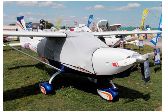
Jabiru Spandex FlyAway Travel Canopy Cover