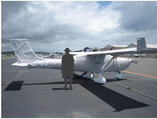
Jabiru J430 Complete Cover Set