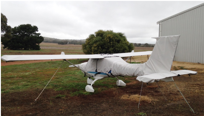
Jabiru 160 Canopy, Engine, Prop, Wings & Empennage Covers Jabiru 160 Canopy, Engine, Prop, Wings & Empennage Covers