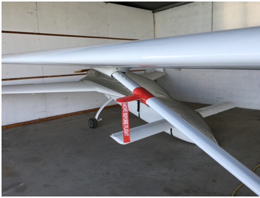
Jabiru Pitot Cover