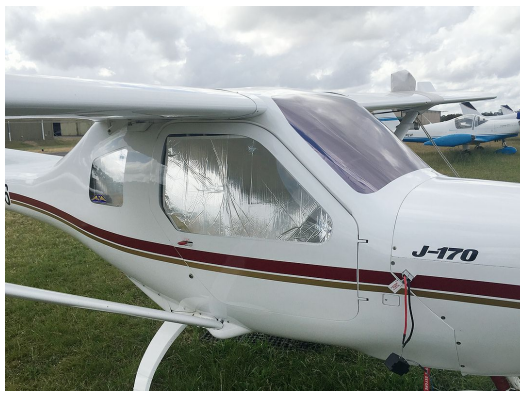
Jabiru 170 Heatshield Set