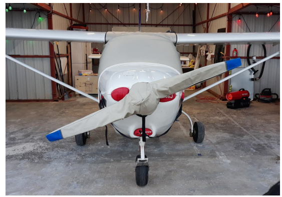
Jabiru J250 Canopy & Prop Cover