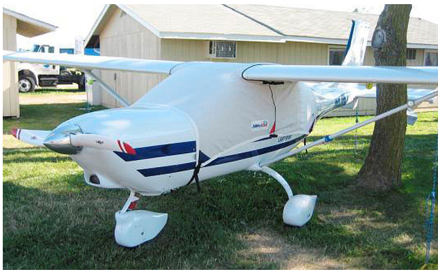
Jabiru 250 Standard Canopy Cover