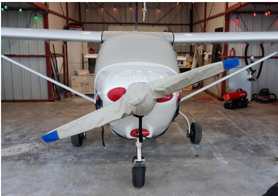
Jabiru J250 Canopy & Prop Cover