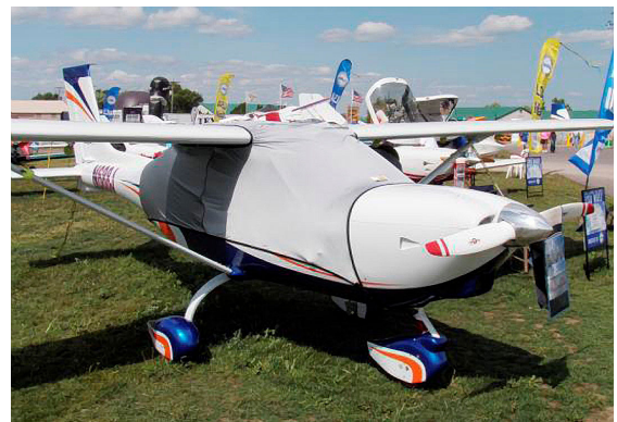
Jabiru Spandex FlyAway Travel Canopy Cover