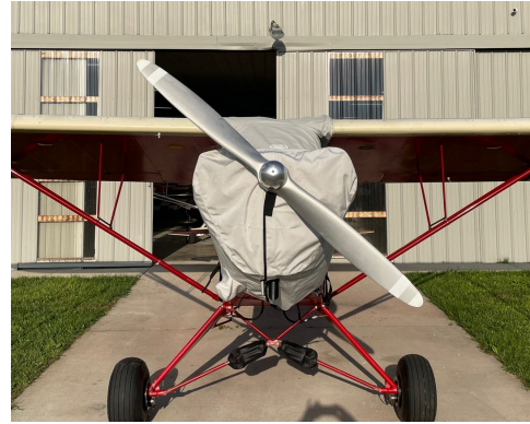
Piper J3 Cub Engine Cover, fully enclosed