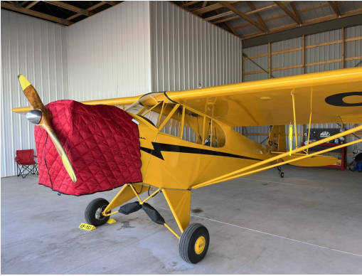
Piper J3 Cub Insulated Hangar Blanket