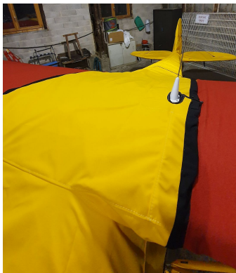
Piper J3 Over The Top Style Canopy Cover & Empennage Cover

This cover type is made from Silver Acrylic Sunbrella canvas and is 100% lined with a soft and smooth microfiber. Bruce's Custom Covers developed this material combination especially for aircraft protection. The outer material is medium weight and treated for water resistance, UV resistance and anti-static buildup. The inner lining is a very soft and smooth microfiber to prevent scratching. The material is very reflective, and tests show that the cabin interior temperature can be reduced to near-ambient temperature on the hottest of days. It is water, ice and snow repellent, yet breathable to allow moisture to escape from between the cover and the aircraft surface.