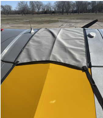
Piper PA-18 Windshield/Skylight Cover

This cover type is made from Silver Acrylic Sunbrella canvas and is 100% lined with a soft and smooth microfiber. Bruce's Custom Covers developed this material combination especially for aircraft protection. The outer material is medium weight and treated for water resistance, UV resistance and anti-static buildup. The inner lining is a very soft and smooth microfiber to prevent scratching. The material is very reflective, and tests show that the cabin interior temperature can be reduced to near-ambient temperature on the hottest of days. It is water, ice and snow repellent, yet breathable to allow moisture to escape from between the cover and the aircraft surface.