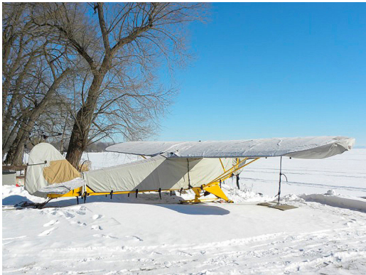
Piper J3 Cub Full Cover Set

WINTER USE MATERIAL - Made with Solution-Dyed Polyester fabric, this option is intended for seasonal use to aid in deicing, rain mitigation, or for occasional travel. The material is lighter and more compact, but more susceptible to UV damage and may have a shorter useful life if used continuously outside than the all-year use material.