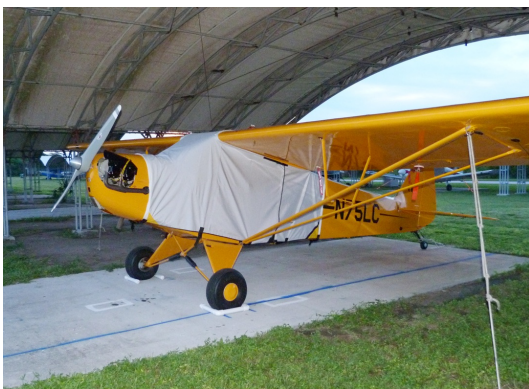
Piper J-3 Extended Canopy Cover

This cover type is made from Silver Acrylic Sunbrella canvas and is 100% lined with a soft and smooth microfiber. Bruce's Custom Covers developed this material combination especially for aircraft protection. The outer material is medium weight and treated for water resistance, UV resistance and anti-static buildup. The inner lining is a very soft and smooth microfiber to prevent scratching. The material is very reflective, and tests show that the cabin interior temperature can be reduced to near-ambient temperature on the hottest of days. It is water, ice and snow repellent, yet breathable to allow moisture to escape from between the cover and the aircraft surface.