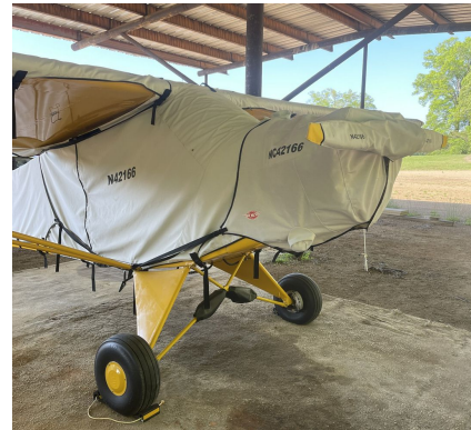
Piper J-3C-65 Cub Engine Cover, Fully Enclosed