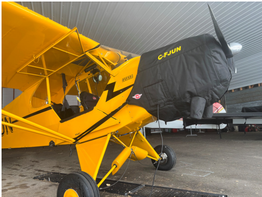
Piper J3 Cub Insulated Engine Cover