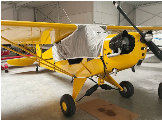
Piper J-3 Cub Travel Cover, Over-The-Top Style