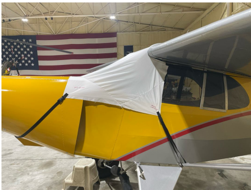
Piper J5A Windshield/Skylight Cover, test fit

This cover type is made from Silver Acrylic Sunbrella canvas and is 100% lined with a soft and smooth microfiber. Bruce's Custom Covers developed this material combination especially for aircraft protection. The outer material is medium weight and treated for water resistance, UV resistance and anti-static buildup. The inner lining is a very soft and smooth microfiber to prevent scratching. The material is very reflective, and tests show that the cabin interior temperature can be reduced to near-ambient temperature on the hottest of days. It is water, ice and snow repellent, yet breathable to allow moisture to escape from between the cover and the aircraft surface.