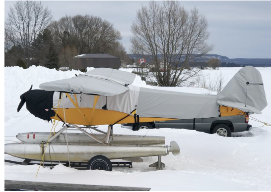
Piper J3 Cub Extended Canopy, Wings, Empennage & Insulated Engine Covers