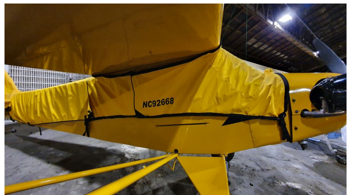
Piper J3 Over The Top Style Canopy Cover & Empennage Cover