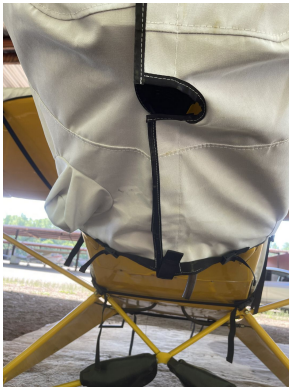
Piper J-3C-65 Cub Engine Cover, Fully Enclosed

WINTER USE MATERIAL - Made with Solution-Dyed Polyester fabric, this option is intended for seasonal use to aid in deicing, rain mitigation, or for occasional travel. The material is lighter and more compact, but more susceptible to UV damage and may have a shorter useful life if used continuously outside than the all-year use material.