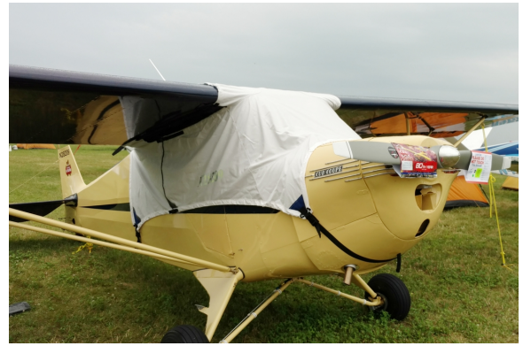
Piper J-4 Cub Coupe Canopy Cover (Over-Top)