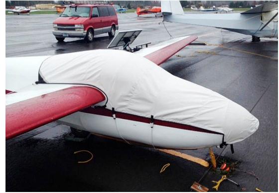
SGS 1-26B Canopy/Nose Cover