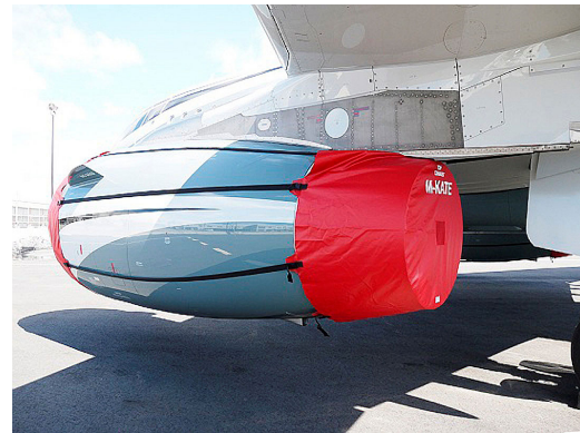
Airbus A319 Intake/Exhaust Covers set, IAE V2500