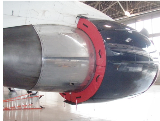
Boeing 767 Exhaust Plugs Ship Set, incl. Fan Thrust Reverser and Exhaust Plugs P/N: B767-200