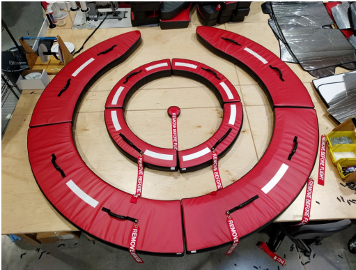
Boeing 747-8 Exhaust Plugs

The Engine Inlet Plugs are custom fit for your Boeing KC-46, KC-46A, Pegasus intakes, made with heavy-duty vinyl material, and stuffed with a single block of sculpted urethane foam. Each plug has a zipper that allows the foam to be removed and dried if necessary. Engine plugs have 'remove before flight' streamers sewn onto the face of the plugs. Most plugs are imprinted with the aircraft registration number in black for an extra charge. Storage bag NOT included. Engine plugs may be inserted after flight when the engine is still warm. Engine Inlet Plugs are commonly referred to as Cowl Plugs, Intake Plugs, Cowl Blocks, Engine Blocks, and Engine Bungs.