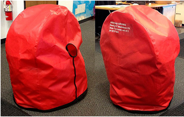
Boeing 757 Tire Covers, great for Wash Prep or Storage

ALL-YEAR USE MATERIAL - Made with Silver Acrylic Sunbrella canvas, the all-year use material is the best option for sun protection and cover longevity. This heavier more durable material is intended for all weather conditions, such as rain and snow or lots of sun.