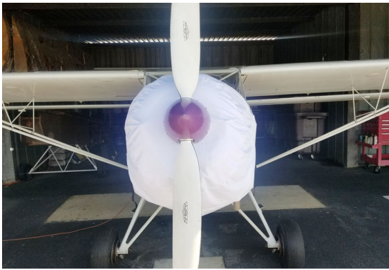
Kitfox Engine Cover, "Radial Cowl" type, test fit

This cover type is made from Silver Acrylic Sunbrella canvas and is 100% lined with a soft and smooth microfiber. Bruce's Custom Covers developed this material combination especially for aircraft protection. The outer material is medium weight and treated for water resistance, UV resistance and anti-static buildup. The inner lining is a very soft and smooth microfiber to prevent scratching. The material is very reflective, and tests show that the cabin interior temperature can be reduced to near-ambient temperature on the hottest of days. It is water, ice and snow repellent, yet breathable to allow moisture to escape from between the cover and the aircraft surface.