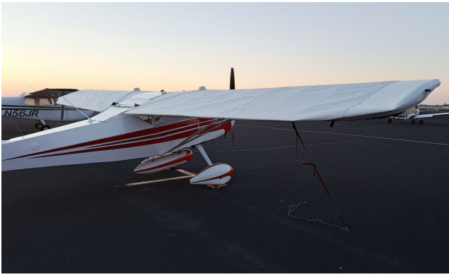
Kitfox Wing Covers