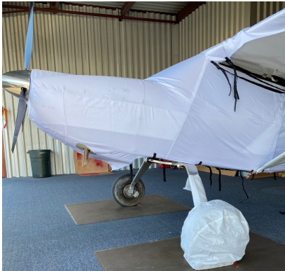
Kitfox Extended Canopy/Engine Cover, test fit cover