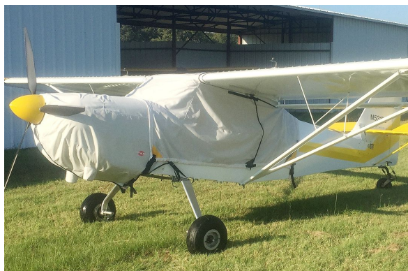
Kitfox Canopy & Engine Cover