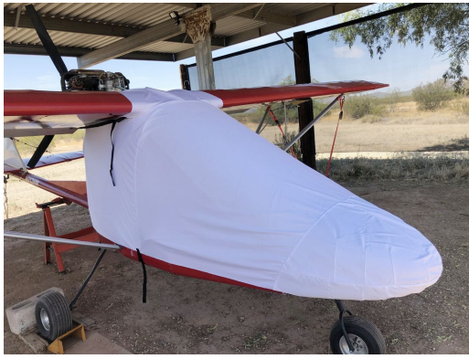
Rans S-12 Airaile Canopy/Nose Cover (test fit cover)