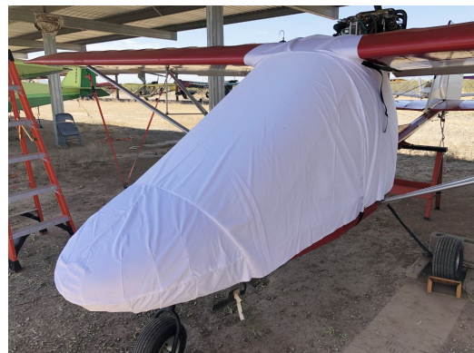
Rans S-12 Airaille Canopy/Nose Cover (test fit cover)