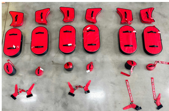
Sikorsky UH-60A Plug Set

The Engine Inlet Plugs are custom fit for your Kaman KMAX intakes, made with heavy-duty vinyl material, and stuffed with a single block of sculpted urethane foam. Each plug has a zipper that allows the foam to be removed and dried if necessary. Engine plugs have 'Remove Before Flight' streamers sewn onto the face of the plugs. Most plugs are imprinted with the aircraft registration number in black for an extra charge. Storage bag NOT included. Engine plugs may be inserted after flight when the engine is still warm. Engine Inlet Plugs are commonly referred to as Cowl Plugs, Intake Plugs, Cowl Blocks, Engine Blocks, and Engine Bungs.