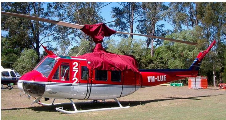
Bell 204/205 Engine/Mid-Cabin Cover, Main & Tail Rotor Covers