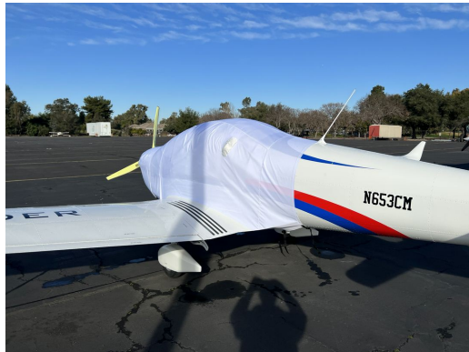
Jihlavan JA-600 Skyleader Extended Canopy/Engine Cover, test fit cover

This cover type is made from Silver Acrylic Sunbrella canvas and is 100% lined with a soft and smooth microfiber. Bruce's Custom Covers developed this material combination especially for aircraft protection. The outer material is medium weight and treated for water resistance, UV resistance and anti-static buildup. The inner lining is a very soft and smooth microfiber to prevent scratching. The material is very reflective, and tests show that the cabin interior temperature can be reduced to near-ambient temperature on the hottest of days. It is water, ice and snow repellent, yet breathable to allow moisture to escape from between the cover and the aircraft surface.