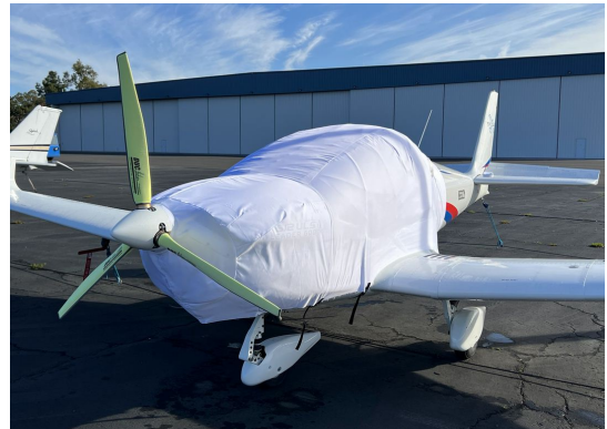
Jihlavan JA-600 Skyleader Extended Canopy/Engine Cover, test fit cover