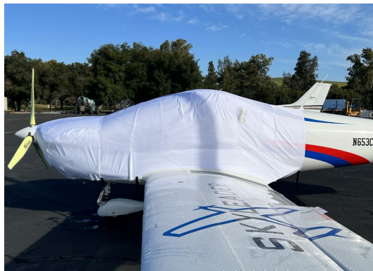
Jihlavan JA-600 Skyleader Extended Canopy/Engine Cover, test fit cover

This cover type is made from Silver Acrylic Sunbrella canvas and is 100% lined with a soft and smooth microfiber. Bruce's Custom Covers developed this material combination especially for aircraft protection. The outer material is medium weight and treated for water resistance, UV resistance and anti-static buildup. The inner lining is a very soft and smooth microfiber to prevent scratching. The material is very reflective, and tests show that the cabin interior temperature can be reduced to near-ambient temperature on the hottest of days. It is water, ice and snow repellent, yet breathable to allow moisture to escape from between the cover and the aircraft surface.