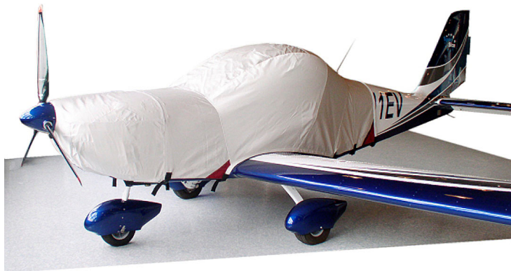
Evektor Sportstar Extended Canopy/Engine Cover