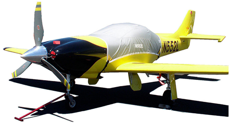
Canopy Cover for Lancair Legacy