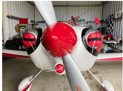
Van's RV-8 Engine Inlet Plugs, Sam James Cowl