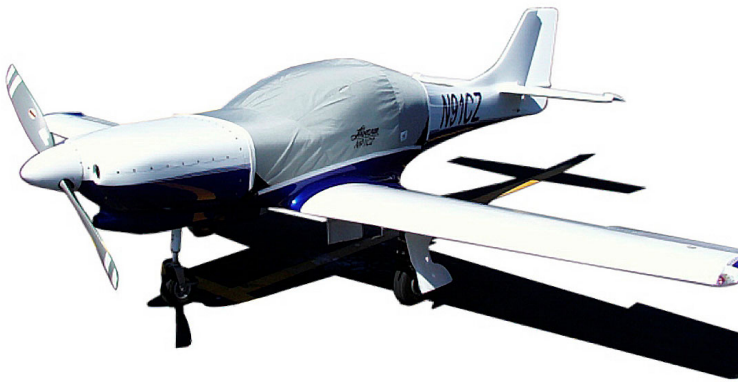
Canopy Cover for Lancair 320/360