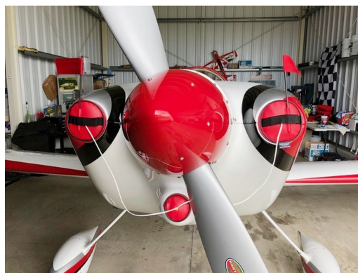
Van's RV-8 Engine Inlet Plugs, Sam James Cowl