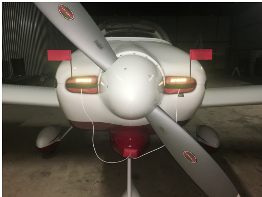
Van's Aircraft RV-7A Engine Inlet Plugs

Engine Inlet Plugs are custom fit for your Rand-Robinson KR-2 intakes, made with heavy-duty vinyl material, and stuffed with a single block of sculpted urethane foam. Each plug has a zipper that allows the foam to be removed and dried if necessary. Engine plugs have warning flags that are visible from the cockpit or 'remove before flight' streamers sewn onto the face of the plugs. Most plugs are imprinted with the aircraft registration number in black for an extra charge. Storage bag NOT included. Engine plugs may be inserted after flight when the engine is still warm. Engine Inlet Plugs are commonly referred to as Cowl Plugs, Intake Plugs, Cowl Blocks, Engine Blocks, and Engine Bungs.