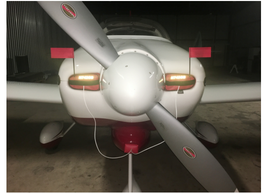
Van's Aircraft RV-7A Engine Inlet Plugs