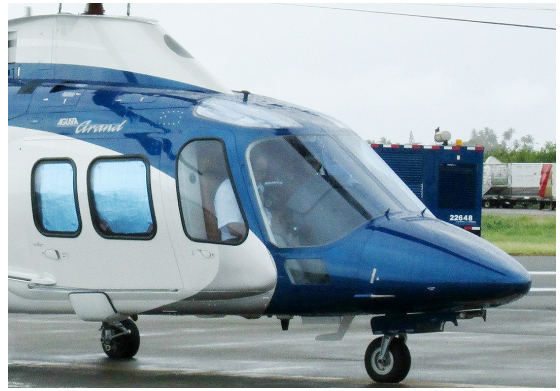
Agusta Grand Cabin & Skylight HeatShields