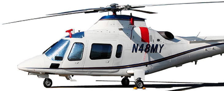
Agusta Power Pitot Covers, Intake Covers, and Cockpit Heatshield set

WINTER USE MATERIAL - Made with Solution-Dyed Polyester fabric, this option is intended for seasonal use to aid in deicing, rain mitigation, or for occasional travel. The material is lighter and more compact, but more susceptible to UV damage and may have a shorter useful life if used continuously outside than the all-year use material.