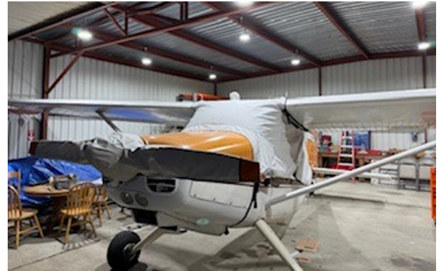
Luscombe Models 11A & 11E: Canopy Cover, Prop Cover