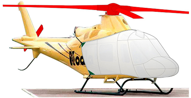
Koala Bubble, Rotor Hub, Blade & Tail Rotor Covers (illustration)