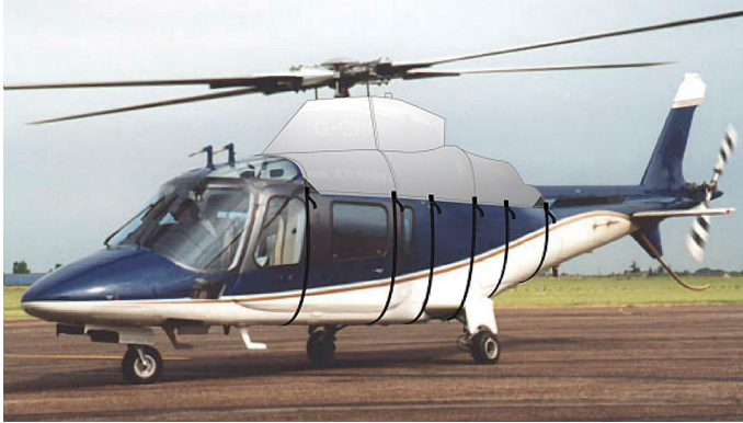
Agusta Power Engine Cover (illustration)

WINTER USE MATERIAL - Made with Solution-Dyed Polyester fabric, this option is intended for seasonal use to aid in deicing, rain mitigation, or for occasional travel. The material is lighter and more compact, but more susceptible to UV damage and may have a shorter useful life if used continuously outside than the all-year use material.