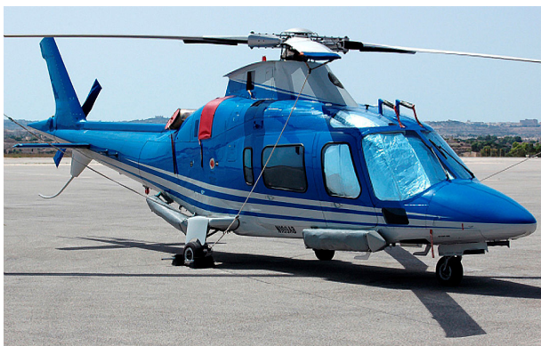
Agusta Power Cockpit HeatShields & Blade Tie-downs

Cabin Heatshields are interior sunshades for the aircraft's passenger cabin area. The product is a unique composite of closed-cell foam with a silver mylar finish. The semi-rigid design is stiff enough to stand inside the window framing. The set folds up flat and is easily stored in the included storage sleeve. Some designs may require velcro and suction cups. A Heatshield is an excellent short-term remedy for cockpit overheating, but an external fabric cover is more effective for long-term protection.