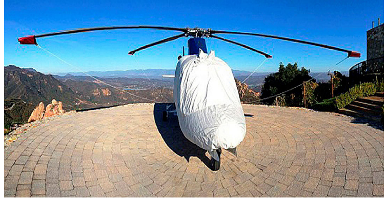
Agusta 109 Mk II+ Bubble Cover and Blade Tie-downs