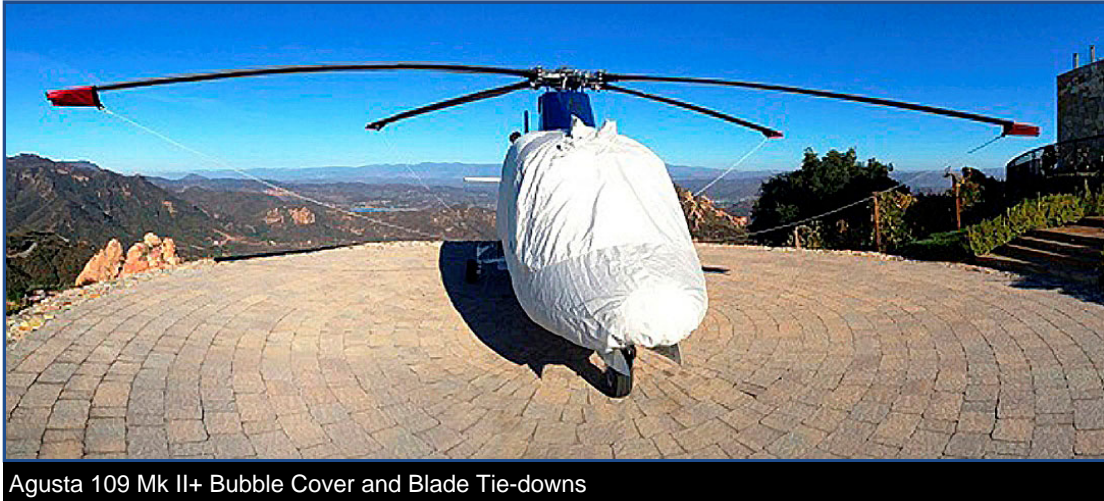
Agusta 109 Mk II+ Bubble Cover and Blade Tie-downs