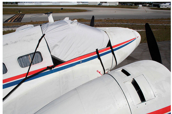
Beech 18 Cockpit Cover