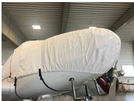
Lockheed 12 Canopy/Nose Cover

This cover type is made from Silver Acrylic Sunbrella canvas and is 100% lined with a soft and smooth microfiber. Bruce's Custom Covers developed this material combination especially for aircraft protection. The outer material is medium weight and treated for water resistance, UV resistance and anti-static buildup. The inner lining is a very soft and smooth microfiber to prevent scratching. The material is very reflective, and tests show that the cabin interior temperature can be reduced to near-ambient temperature on the hottest of days. It is water, ice and snow repellent, yet breathable to allow moisture to escape from between the cover and the aircraft surface.