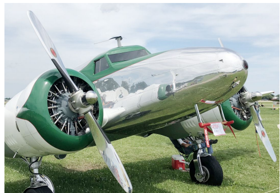
Lockheed 12 Pitot Covers