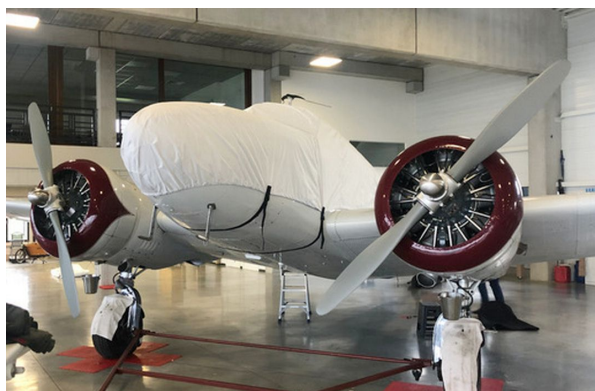
Lockheed 12 Canopy/Nose Cover