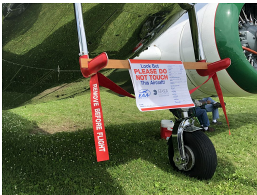
Lockheed 12 Pitot Covers

Lockheed 12 Electra Pitot Tube Covers , NOT HEAT RESISTANT TYPE, are made of Naugahyde vinyl, and are designed to cover the entire pitot assembly. Slipping over the tube, the cover tightens around the base with a Velcro strap detail. A "Remove Before Flight" streamer is attached to the cover. Heat Resistant Pitot Covers are an upgrade to this design, and help prevent the pitot cover from melting onto the tube if the pitot heat is accidentally turned on while installed. If you want the set tethered together, please let us know.