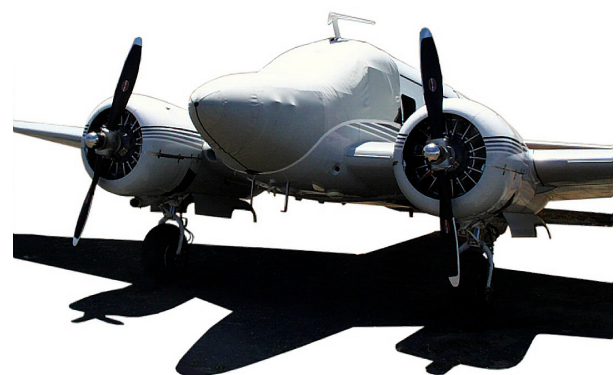
Beech 18 Cockpit/Nose Cover