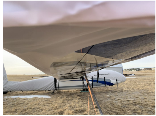
Blanik L-13 Canopy/Nose & Empennage Covers