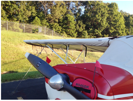
Aeronca Champ Engine Plugs, Wing Covers