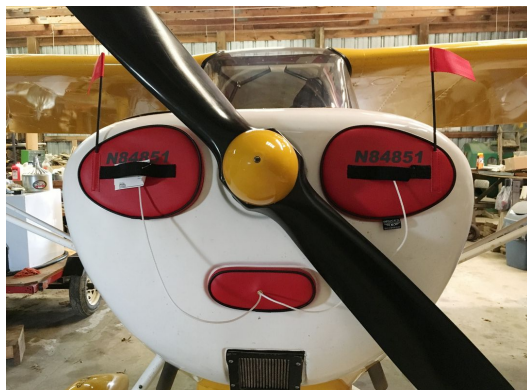
Aeronca 7AC Engine Inlet Plugs