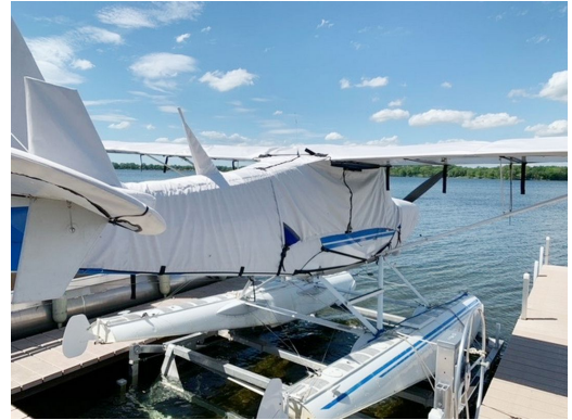
Aeronca 7GC Amphib Cover Set