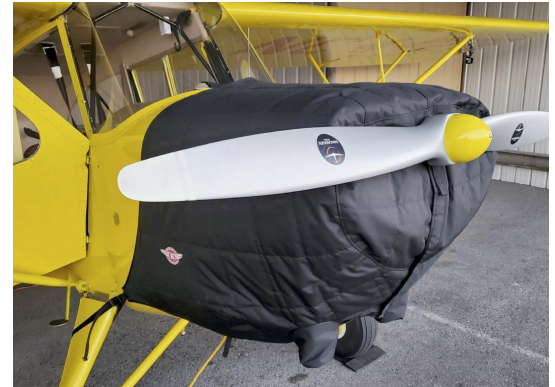
FOR INTERIOR USE. Cub Crafters CC-11 Insulated Hangar Blanket, available in Red or Silver Aeronca Champ 7AC Insulated Engine Cover