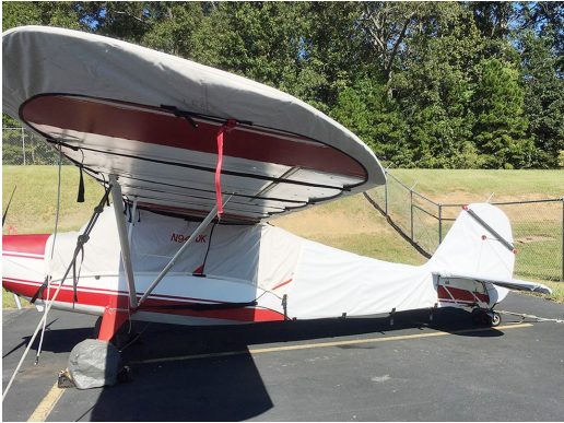
Aeronca Champ 7AC/7EC Wing and Empennage Covers

WINTER USE MATERIAL - Made with Solution-Dyed Polyester fabric, this option is intended for seasonal use to aid in deicing, rain mitigation, or for occasional travel. The material is lighter and more compact, but more susceptible to UV damage and may have a shorter useful life if used continuously outside than the all-year use material.