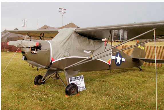
Aeronca 7AC Champ Canopy & Prop Covers

This cover type is made from Silver Acrylic Sunbrella canvas and is 100% lined with a soft and smooth microfiber. Bruce's Custom Covers developed this material combination especially for aircraft protection. The outer material is medium weight and treated for water resistance, UV resistance and anti-static buildup. The inner lining is a very soft and smooth microfiber to prevent scratching. The material is very reflective, and tests show that the cabin interior temperature can be reduced to near-ambient temperature on the hottest of days. It is water, ice and snow repellent, yet breathable to allow moisture to escape from between the cover and the aircraft surface.