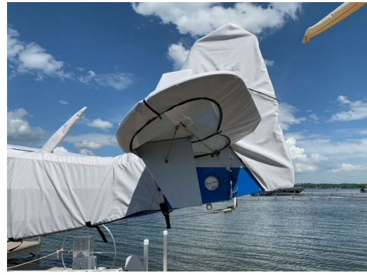
Aeronca 7GC Amphib Cover Set