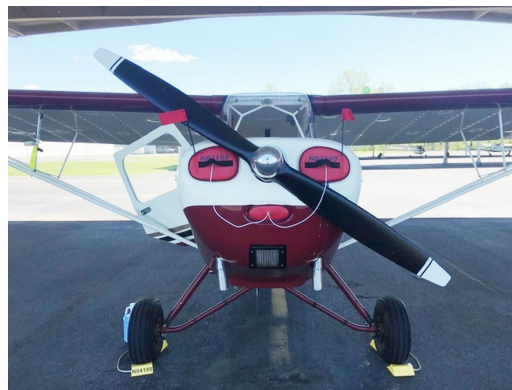
Aeronca Champ 7AC, 7EC Engine Inlet Plugs