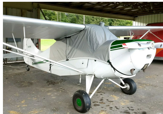
Aeronca Champ Light Weight Travel Canopy Cover, Over-Top Style