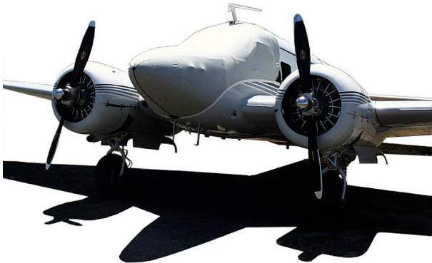
Beech 18 Cockpit/Nose Cover