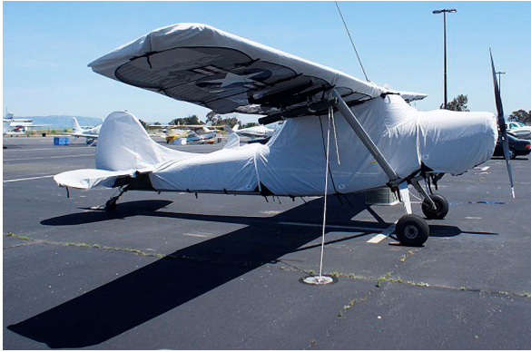
Wing Covers on Cessna Bird Dog

This cover type is made from Silver Acrylic Sunbrella canvas and is 100% lined with a soft and smooth microfiber. Bruce's Custom Covers developed this material combination especially for aircraft protection. The outer material is medium weight and treated for water resistance, UV resistance and anti-static buildup. The inner lining is a very soft and smooth microfiber to prevent scratching. The material is very reflective, and tests show that the cabin interior temperature can be reduced to near-ambient temperature on the hottest of days. It is water, ice and snow repellent, yet breathable to allow moisture to escape from between the cover and the aircraft surface.