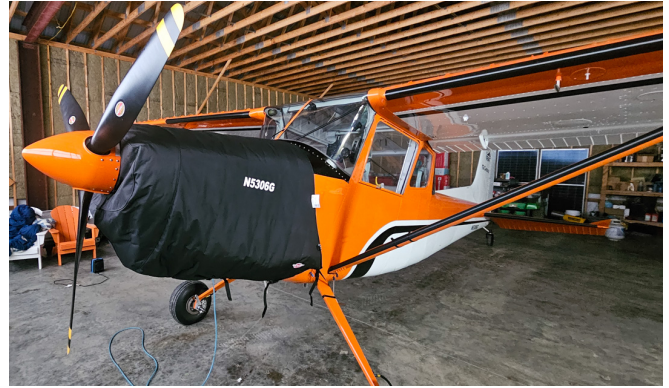
Cessna Bird Dog, L-19, O-1, 305 Insulated Engine Cover