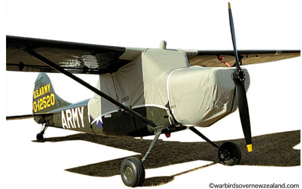
Cessna L-19 Canopy & Engine Covers