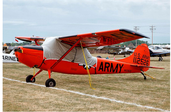
Cessna L-19 Bird Dog Canopy Cover