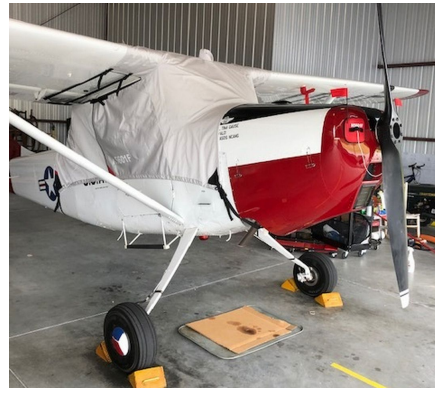
Cessna Bird Dog, L-19, O-1, 305 Canopy Cover, Over-Top Type