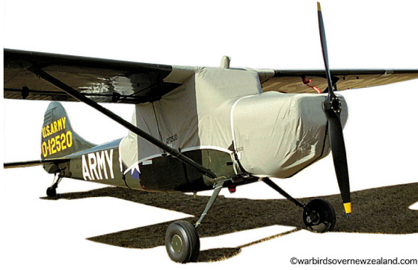
Cessna L-19 Canopy & Engine Covers

The material is very reflective, and tests show that the cabin interior temperature can be reduced to near-ambient temperature on the hottest of days. It is water, ice and snow repellent, yet breathable to allow moisture to escape from between the cover and the aircraft surface.