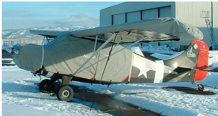
Extended Canopy Cover, Engine & Wing Covers