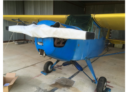
Taylorcraft L-2 Grasshopper Propellor/Spinner Cover