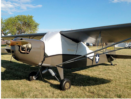
Taylorcraft L-2 Canopy Cover

This cover type is made from Silver Acrylic Sunbrella canvas and is 100% lined with a soft and smooth microfiber. Bruce's Custom Covers developed this material combination especially for aircraft protection. The outer material is medium weight and treated for water resistance, UV resistance and anti-static buildup. The inner lining is a very soft and smooth microfiber to prevent scratching. The material is very reflective, and tests show that the cabin interior temperature can be reduced to near-ambient temperature on the hottest of days. It is water, ice and snow repellent, yet breathable to allow moisture to escape from between the cover and the aircraft surface.