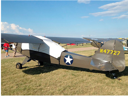
Taylorcraft L-2 Canopy Cover

This cover type is made from Silver Acrylic Sunbrella canvas and is 100% lined with a soft and smooth microfiber. Bruce's Custom Covers developed this material combination especially for aircraft protection. The outer material is medium weight and treated for water resistance, UV resistance and anti-static buildup. The inner lining is a very soft and smooth microfiber to prevent scratching. The material is very reflective, and tests show that the cabin interior temperature can be reduced to near-ambient temperature on the hottest of days. It is water, ice and snow repellent, yet breathable to allow moisture to escape from between the cover and the aircraft surface.