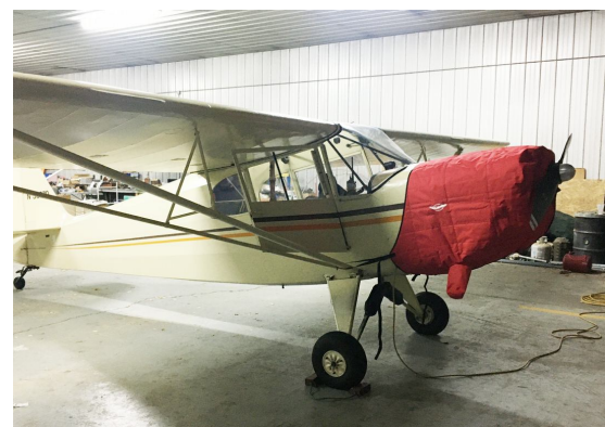
Taylorcraft DC-65 Insulated Engine Cover

This cover type is made from Silver Acrylic Sunbrella canvas and is 100% lined with a soft and smooth microfiber. Bruce's Custom Covers developed this material combination especially for aircraft protection. The outer material is medium weight and treated for water resistance, UV resistance and anti-static buildup. The inner lining is a very soft and smooth microfiber to prevent scratching. The material is very reflective, and tests show that the cabin interior temperature can be reduced to near-ambient temperature on the hottest of days. It is water, ice and snow repellent, yet breathable to allow moisture to escape from between the cover and the aircraft surface.