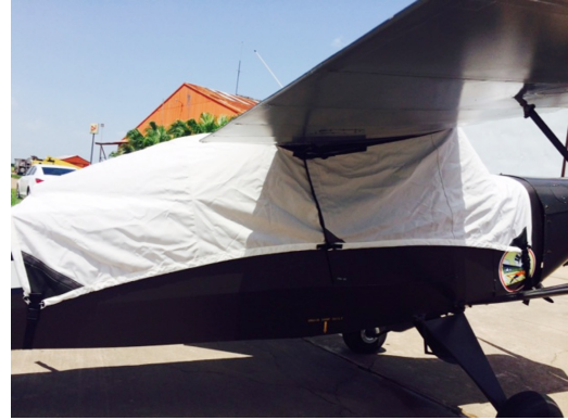
Taylorcraft L-2 Canopy Cover