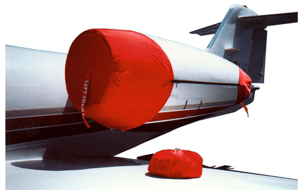
Lear 35 Engine Covers