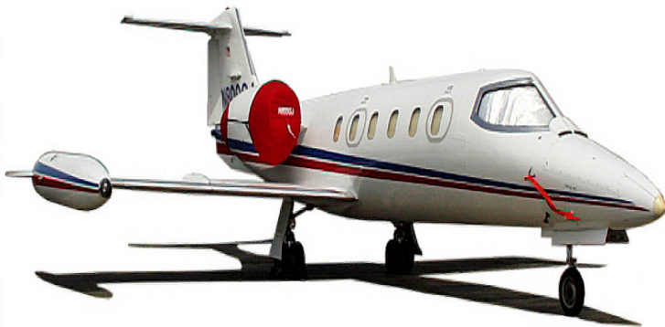
Lear 35 Engine Covers, Pitot Covers & Cockpit HeatShields

The Lear 24 & 25 Bikini Style Engine Covers are a single-piece design using a soft and smooth stretchy and fabric. The cover stretches tightly over both the intake and exhaust, installing quickly and easily. These covers are designed to be used as hangar dust covers and have a useful life of approximately one year.