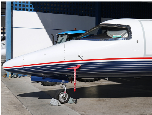
Lear Pitot Cover

The Engine Inlet Plugs are custom fit for your Lear 24 & 25 intakes, made with heavy-duty vinyl material, and stuffed with a single block of sculpted urethane foam. Each plug has a zipper that allows the foam to be removed and dried if necessary. Engine plugs have 'remove before flight' streamers sewn onto the face of the plugs. Most plugs are imprinted with the aircraft registration number in black for an extra charge. Storage bag NOT included. Engine plugs may be inserted after flight when the engine is still warm. Engine Inlet Plugs are commonly referred to as Cowl Plugs, Intake Plugs, Cowl Blocks, Engine Blocks, and Engine Bungs.