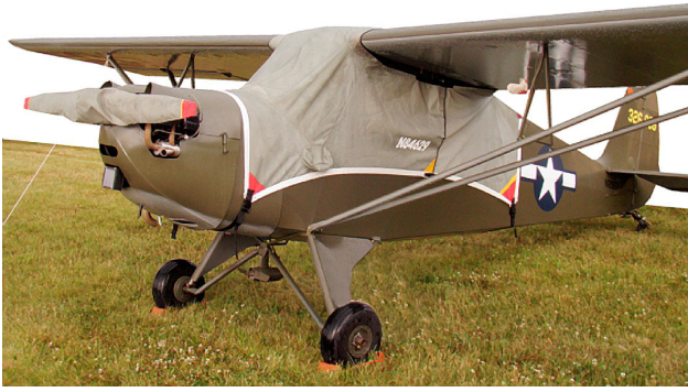
L3 Canopy Cover & Prop Cover