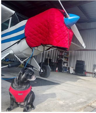
Piper PA-12 Insulated Hangar Blanket