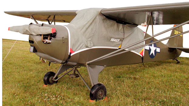
L3 Canopy Cover &amp; Prop Cover

This cover type is made from Silver Acrylic Sunbrella canvas and is 100% lined with a soft and smooth microfiber. Bruce's Custom Covers developed this material combination especially for aircraft protection. The outer material is medium weight and treated for water resistance, UV resistance and anti-static buildup. The inner lining is a very soft and smooth microfiber to prevent scratching. The material is very reflective, and tests show that the cabin interior temperature can be reduced to near-ambient temperature on the hottest of days. It is water, ice and snow repellent, yet breathable to allow moisture to escape from between the cover and the aircraft surface.