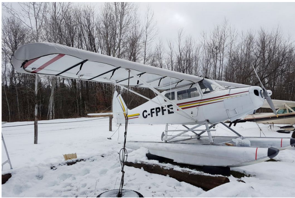
Christavia Mk 1 Wing Covers

WINTER USE MATERIAL - Made with Solution-Dyed Polyester fabric, this option is intended for seasonal use to aid in deicing, rain mitigation, or for occasional travel. The material is lighter and more compact, but more susceptible to UV damage and may have a shorter useful life if used continuously outside than the all-year use material.