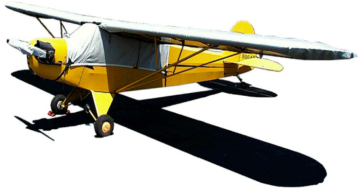
Piper J3 Canopy, Wing and Prop Covers