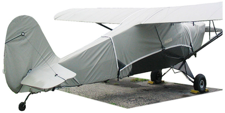
Taylorcraft L-2 Grasshopper Prop, Engine, Canopy, Wing and Empennage Covers