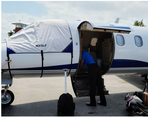
Lear 31A Cockpit Cover