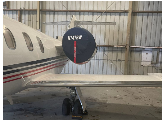
Lear 35A Engine Covers