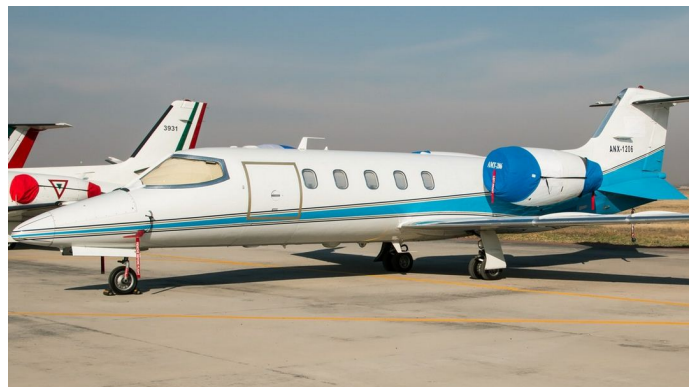
Lear 35 Engine & Pitot Covers