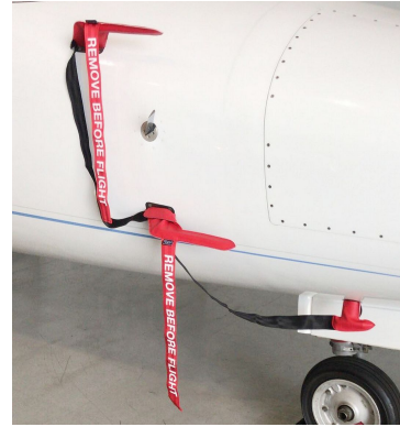
Lear 45 Pitot & Rosemont Cover Set