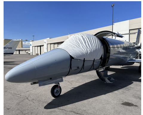
Lear 45 Cockpit Cover