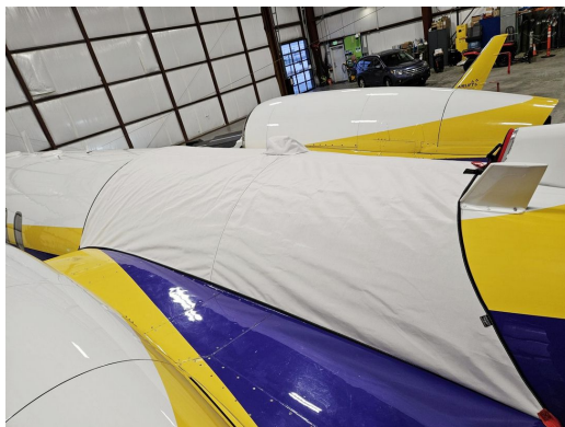
Lear 45 Empennage Saddle Cover W/ Dorsal Inlet Plug (Covers Upper Fuselage Between Pylons, Acm/Apu Area)

WINTER USE MATERIAL - Made with Solution-Dyed Polyester fabric, this option is intended for seasonal use to aid in deicing, rain mitigation, or for occasional travel. The material is lighter and more compact, but more susceptible to UV damage and may have a shorter useful life if used continuously outside than the all-year use material.