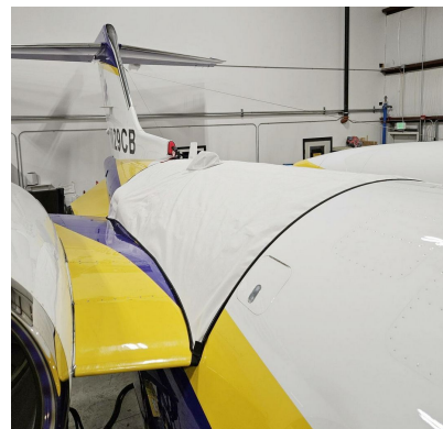
Lear 45 Empennage Saddle Cover W/ Dorsal Inlet Plug (Covers Upper Fuselage Between Pylons, Acm/Apu Area)