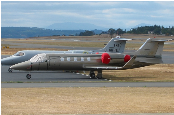
Lear 31A Cockpit Cover, Engine Covers