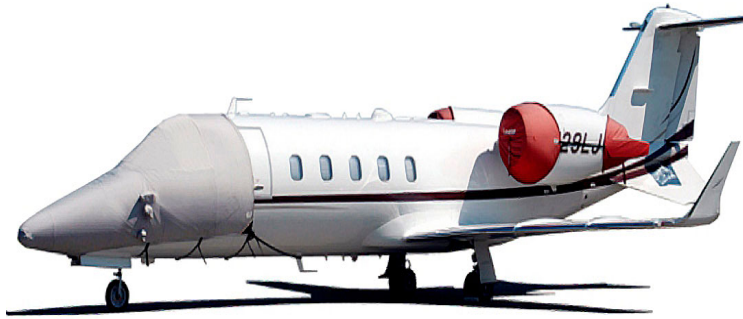
Lear 45 Windshield/Nose & Engine Cover Set

This cover type is made from Silver Acrylic Sunbrella canvas and is 100% lined with a soft and smooth microfiber. Bruce's Custom Covers developed this material combination especially for aircraft protection. The outer material is medium weight and treated for water resistance, UV resistance and anti-static buildup. The inner lining is a very soft and smooth microfiber to prevent scratching. The material is very reflective, and tests show that the cabin interior temperature can be reduced to near-ambient temperature on the hottest of days. It is water, ice and snow repellent, yet breathable to allow moisture to escape from between the cover and the aircraft surface.