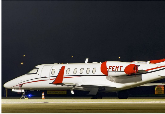
Lear 45 Engine Covers

The Lear Models 40 & 45 Bikini Style Engine Covers are a single-piece design using a soft and smooth stretchy and fabric. The cover stretches tightly over both the intake and exhaust, installing quickly and easily. These covers are designed to be used as hangar dust covers and have a useful life of approximately one year.