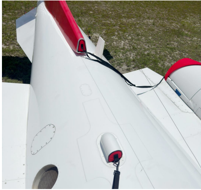
Lear 45 Dorsal, ACM & Fuel Vent Inlet Plugs

The Engine Inlet Plugs are custom fit for your Lear Models 40 & 45 intakes, made with heavy-duty vinyl material, and stuffed with a single block of sculpted urethane foam. Each plug has a zipper that allows the foam to be removed and dried if necessary. Engine plugs have 'remove before flight' streamers sewn onto the face of the plugs. Most plugs are imprinted with the aircraft registration number in black for an extra charge. Storage bag NOT included. Engine plugs may be inserted after flight when the engine is still warm. Engine Inlet Plugs are commonly referred to as Cowl Plugs, Intake Plugs, Cowl Blocks, Engine Blocks, and Engine Bungs.