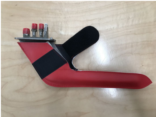
Lear 55 Pitot Cover