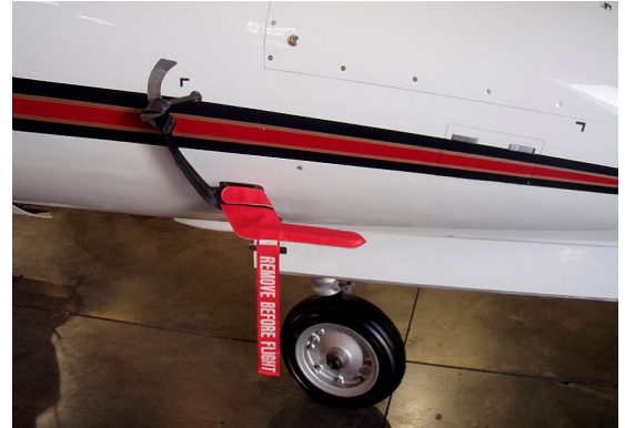
Learjet Heat Resistant Pitot Cover with AOA strap