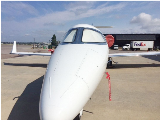
Lear Models 40 & 45 Cockpit Heatshields, Covers All Cockpit Windows

Cockpit Heatshields are interior sunshades for the aircraft's cockpit. The product is a unique composite of closed-cell foam with a silver mylar finish. The semi-rigid design is stiff enough to stand inside the window framing. The set folds up flat and is easily stored in the included storage sleeve. Some designs may require velcro and suction cups. Our Heatshields for jets are offered white side out because some aircraft manufacturers have issued advisories against reflective window inserts due to potential heat damage. A Heatshield is an excellent short-term remedy for cockpit overheating, but an external fabric cover is more effective for long-term protection.