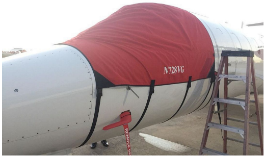
Learjet 45 Cockpit Cover

This cover type is made from Silver Acrylic Sunbrella canvas and is 100% lined with a soft and smooth microfiber. Bruce's Custom Covers developed this material combination especially for aircraft protection. The outer material is medium weight and treated for water resistance, UV resistance and anti-static buildup. The inner lining is a very soft and smooth microfiber to prevent scratching. The material is very reflective, and tests show that the cabin interior temperature can be reduced to near-ambient temperature on the hottest of days. It is water, ice and snow repellent, yet breathable to allow moisture to escape from between the cover and the aircraft surface.