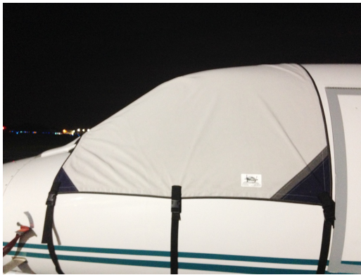
Lear 31 Cockpit Cover

This cover type is made from Silver Acrylic Sunbrella canvas and is 100% lined with a soft and smooth microfiber. Bruce's Custom Covers developed this material combination especially for aircraft protection. The outer material is medium weight and treated for water resistance, UV resistance and anti-static buildup. The inner lining is a very soft and smooth microfiber to prevent scratching. The material is very reflective, and tests show that the cabin interior temperature can be reduced to near-ambient temperature on the hottest of days. It is water, ice and snow repellent, yet breathable to allow moisture to escape from between the cover and the aircraft surface.