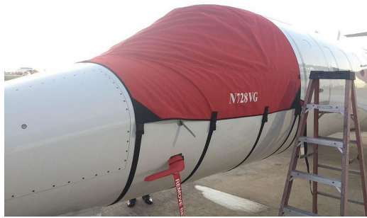
Learjet 45 Cockpit Cover

This cover type is made from Silver Acrylic Sunbrella canvas and is 100% lined with a soft and smooth microfiber. Bruce's Custom Covers developed this material combination especially for aircraft protection. The outer material is medium weight and treated for water resistance, UV resistance and anti-static buildup. The inner lining is a very soft and smooth microfiber to prevent scratching. The material is very reflective, and tests show that the cabin interior temperature can be reduced to near-ambient temperature on the hottest of days. It is water, ice and snow repellent, yet breathable to allow moisture to escape from between the cover and the aircraft surface.