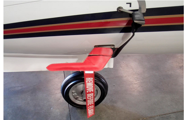
Learjet Heat Resistant Pitot Cover and AOA Strap