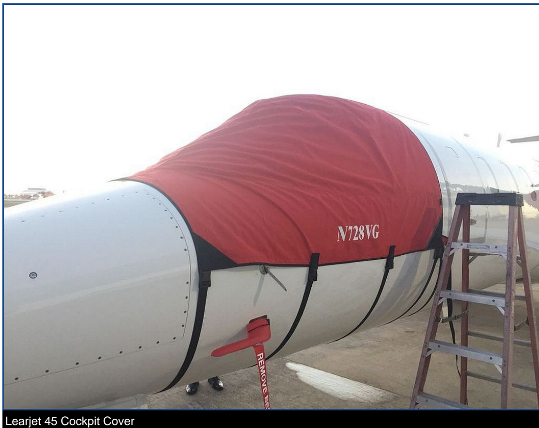
Learjet 45 Cockpit Cover