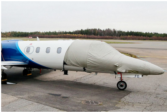
Learjet Cockpit/Nose Cover