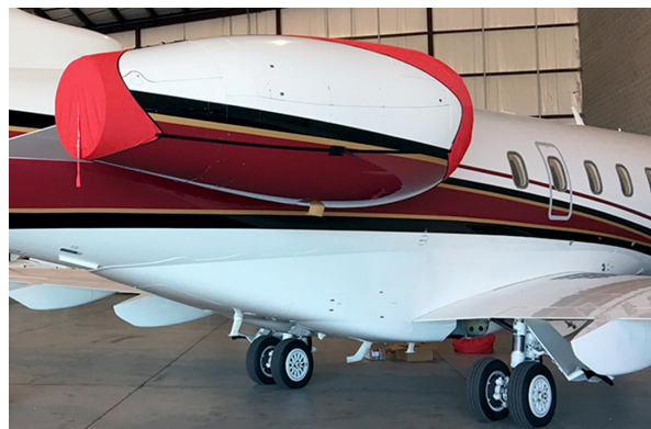
Intake/Exhaust Covers, 3-Strap Type. Successfully installed by two crew, one ladder.