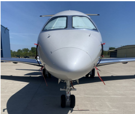
Embraer S A EMB-545 Pitot Cover Set, Cockpit HeatShields