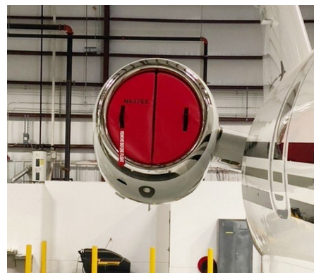
Embraer Legacy 500 Engine Inlet Plugs, folding type