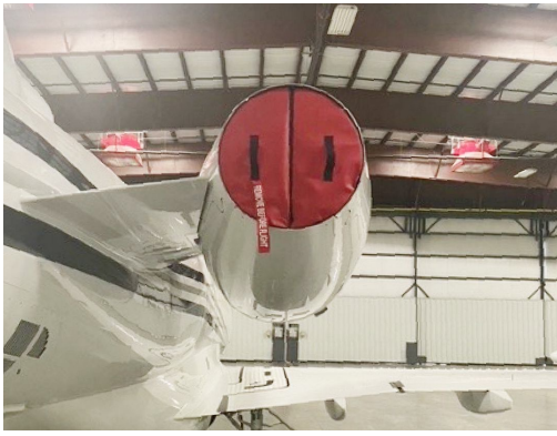
Embraer Legacy 500 Engine Exhaust Plugs, folding type