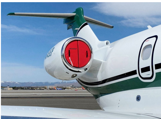
Embraer S A EMB-545 Engine Inlet & Exhaust Plug Set (folding type)

The Engine Inlet Plugs are custom fit for your Embraer Legacy 500 Praetor, (EMB-545/550) intakes, made with heavy-duty vinyl material, and stuffed with a single block of sculpted urethane foam. Each plug has a zipper that allows the foam to be removed and dried if necessary. Engine plugs have 'remove before flight' streamers sewn onto the face of the plugs. Most plugs are imprinted with the aircraft registration number in black for an extra charge. Storage bag NOT included. Engine plugs may be inserted after flight when the engine is still warm. Engine Inlet Plugs are commonly referred to as Cowl Plugs, Intake Plugs, Cowl Blocks, Engine Blocks, and Engine Bungs.