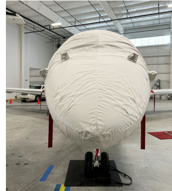
Embraer Legacy 500, (EMB-550) Cockpit/Nose Cover