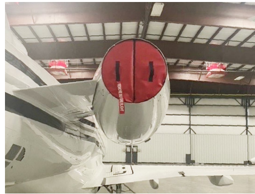
Embraer Legacy 500 Engine Exhaust Plugs, folding type