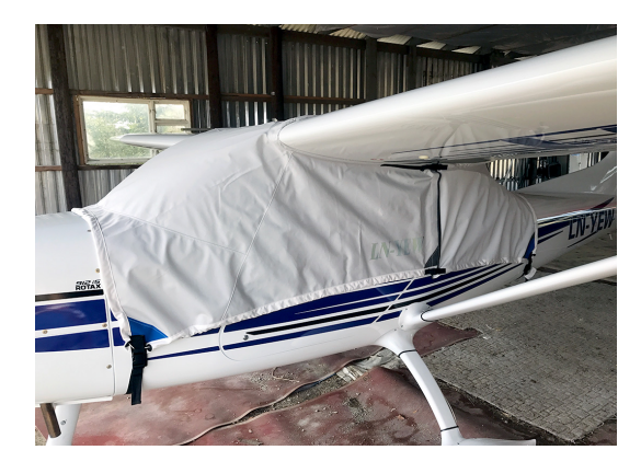
TL Ultralight Sirius TL-3000 Canopy Cover (Over-The-Top Style)