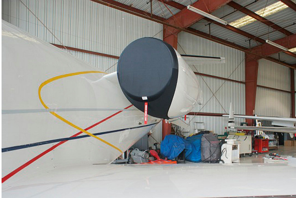
Lear 60 "Bikini Style" Engine Covers

The Lear Models 70 & 75 Bikini Style Engine Covers are a single-piece design using a soft and smooth stretchy and fabric. The cover stretches tightly over both the intake and exhaust, installing quickly and easily. These covers are designed to be used as hangar dust covers and have a useful life of approximately one year.