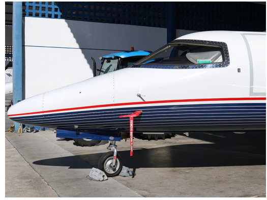
Lear Pitot Cover