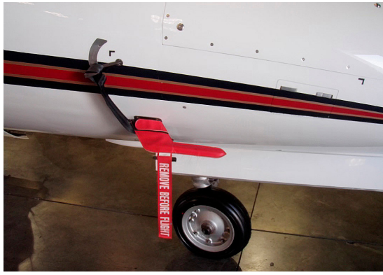
Learjet Heat Resistant Pitot Cover with AOA strap