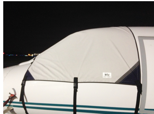
Lear 31 Cockpit Cover