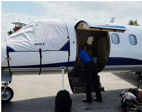
Lear 31A Cockpit Cover

This cover type is made from Silver Acrylic Sunbrella canvas and is 100% lined with a soft and smooth microfiber. Bruce's Custom Covers developed this material combination especially for aircraft protection. The outer material is medium weight and treated for water resistance, UV resistance and anti-static buildup. The inner lining is a very soft and smooth microfiber to prevent scratching. The material is very reflective, and tests show that the cabin interior temperature can be reduced to near-ambient temperature on the hottest of days. It is water, ice and snow repellent, yet breathable to allow moisture to escape from between the cover and the aircraft surface.