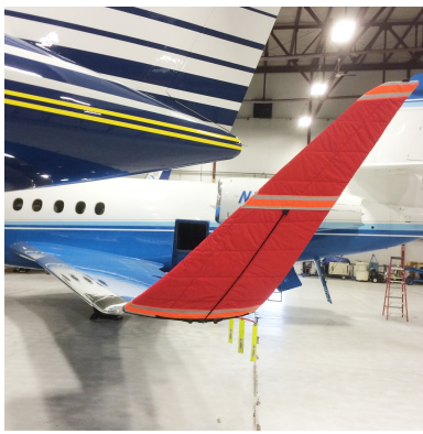
Falcon 2000 Winglet Pad