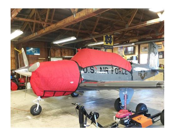
Beech T34 Mentor Canopy Cover, Insulated Engine Cover

This cover type is made from Silver Acrylic Sunbrella canvas and is 100% lined with a soft and smooth microfiber. Bruce's Custom Covers developed this material combination especially for aircraft protection. The outer material is medium weight and treated for water resistance, UV resistance and anti-static buildup. The inner lining is a very soft and smooth microfiber to prevent scratching. The material is very reflective, and tests show that the cabin interior temperature can be reduced to near-ambient temperature on the hottest of days. It is water, ice and snow repellent, yet breathable to allow moisture to escape from between the cover and the aircraft surface.