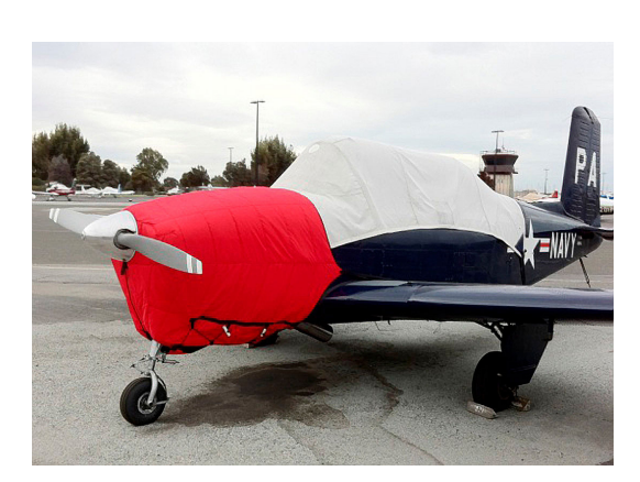
T-34A Insulated Engine Cover