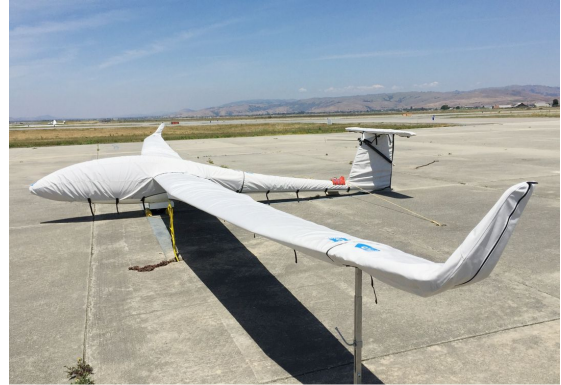
Schemp-Hirth Discus 2B Full Cover Set