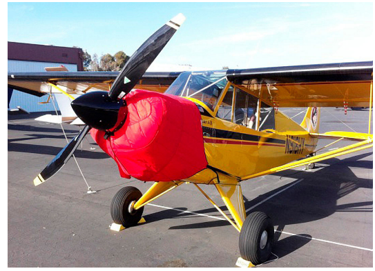
Aviat Husky Insulated Engine Cover