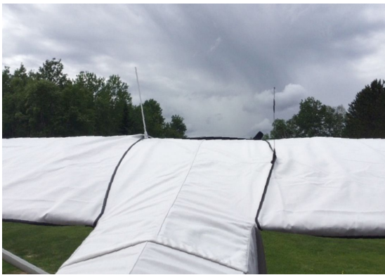
Piper PA-18-150 Super Cub Complete Cover Set

WINTER USE MATERIAL - Made with Solution-Dyed Polyester fabric, this option is intended for seasonal use to aid in deicing, rain mitigation, or for occasional travel. The material is lighter and more compact, but more susceptible to UV damage and may have a shorter useful life if used continuously outside than the all-year use material.