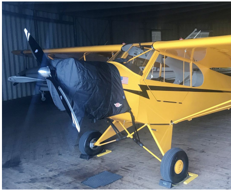
Legend Cub AL3 Insulated Engine Cover