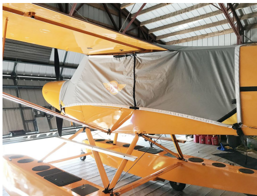
Legend Cub Light Weight Travel Cover

Travel Covers are made with Silver Solution-Dyed Polyester fabric and only lined over the windshield to save weight. The material is lightweight and more compact for easy stowage in the aircraft. The polyester material is water resistant, but only intended for occasional use outside. We also have an ultra lightweight material available for fitted hangar dust covers. For daily outdoor use, the non-travel Sunbrella Cover is the best choice.