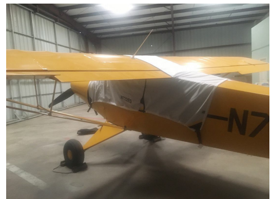
Legend AL18 Canopy Cover, Over Top Type