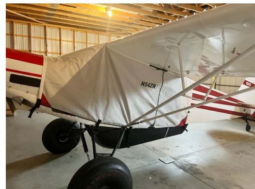
Piper PA-11 Extended Canopy Cover, Over the Top Style