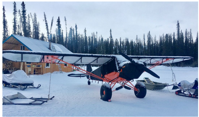
Piper PA-18 Super Cub Canopy Cover (Over-The-Top Style)