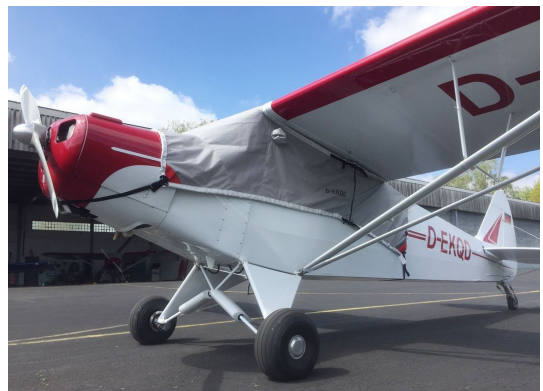
Piper Super Cub Travel Weight Canopy Cover