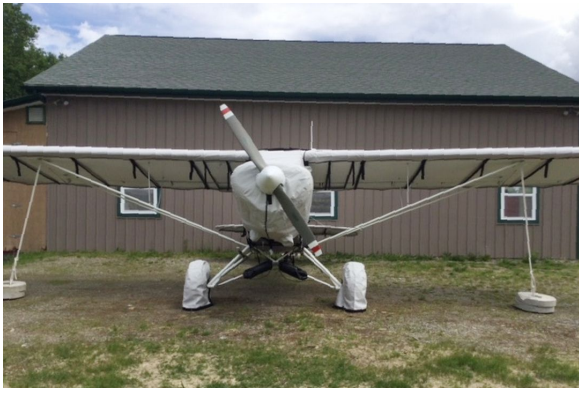
Piper PA-18-150 Super Cub Complete Cover Set