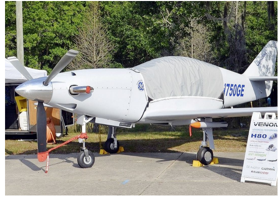
Turbine Legend Canopy Cover