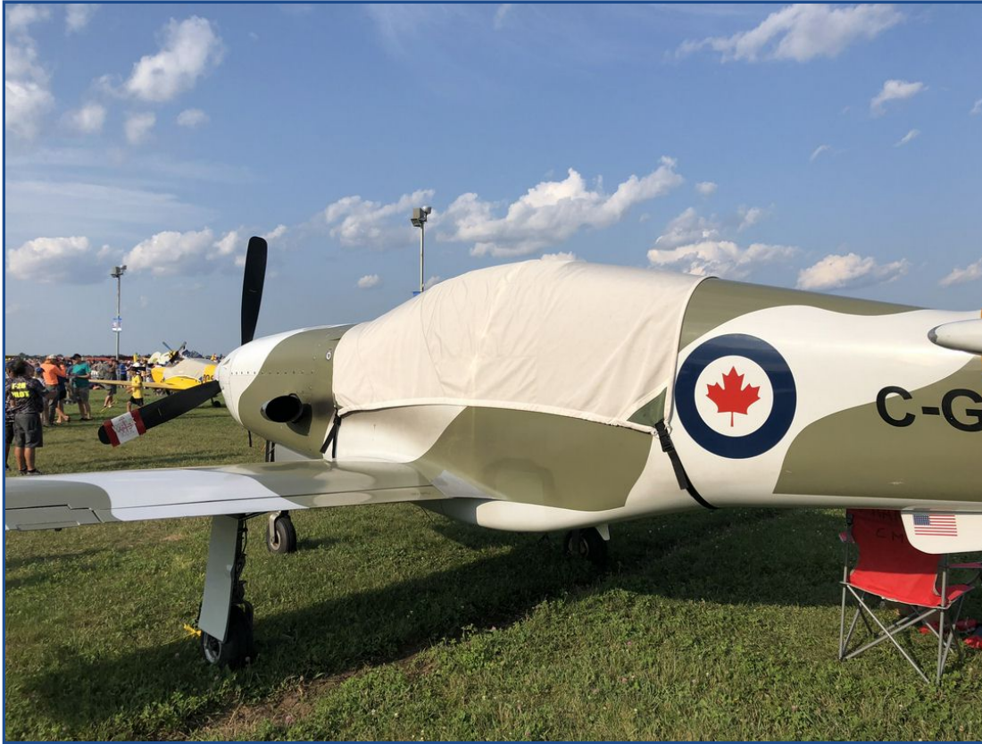
Legend Canopy Cover