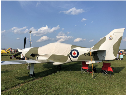
Legend Canopy Cover

the hottest of days. It is water, ice and snow repellent, yet breathable to allow moisture to escape from between the cover and the aircraft surface.