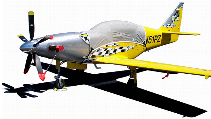
Legend Canopy Cover, Prop Ties, Exhaust Covers & Intake Plugs

This cover type is made from Silver Acrylic Sunbrella canvas and is 100% lined with a soft and smooth microfiber. Bruce's Custom Covers developed this material combination especially for aircraft protection. The outer material is medium weight and treated for water resistance, UV resistance and anti-static buildup. The inner lining is a very soft and smooth microfiber to prevent scratching. The material is very reflective, and tests show that the cabin interior temperature can be reduced to near-ambient temperature on the hottest of days. It is water, ice and snow repellent, yet breathable to allow moisture to escape from between the cover and the aircraft surface.