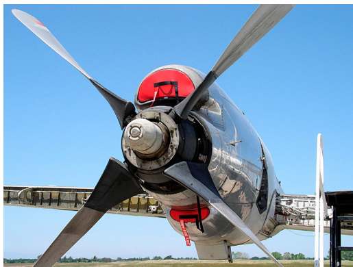
Lockheed P-3 Main Engine Inlet Plugs

Engine Inlet Plugs are custom fit for your Lockheed P-3 Orion intakes, made with heavy-duty vinyl material, and stuffed with a single block of sculpted urethane foam. Each plug has a zipper that allows the foam to be removed and dried if necessary. Engine plugs have warning flags that are visible from the cockpit or 'remove before flight' streamers sewn onto the face of the plugs. Most plugs are imprinted with the aircraft registration number in black for an extra charge. Storage bag NOT included. Engine plugs may be inserted after flight when the engine is still warm. Engine Inlet Plugs are commonly referred to as Cowl Plugs, Intake Plugs, Cowl Blocks, Engine Blocks, and Engine Bungs.