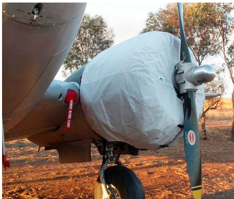
Beech D-18 Engine Covers, Center Section Oil Cooler Inlet Plugs, and Pitot Covers

This cover type is made from Silver Acrylic Sunbrella canvas and is 100% lined with a soft and smooth microfiber. Bruce's Custom Covers developed this material combination especially for aircraft protection. The outer material is medium weight and treated for water resistance, UV resistance and anti-static buildup. The inner lining is a very soft and smooth microfiber to prevent scratching. The material is very reflective, and tests show that the cabin interior temperature can be reduced to near-ambient temperature on the hottest of days. It is water, ice and snow repellent, yet breathable to allow moisture to escape from between the cover and the aircraft surface.