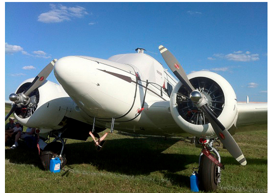
Beech 18 Cockpit Cover & Carb Inlet Plugs