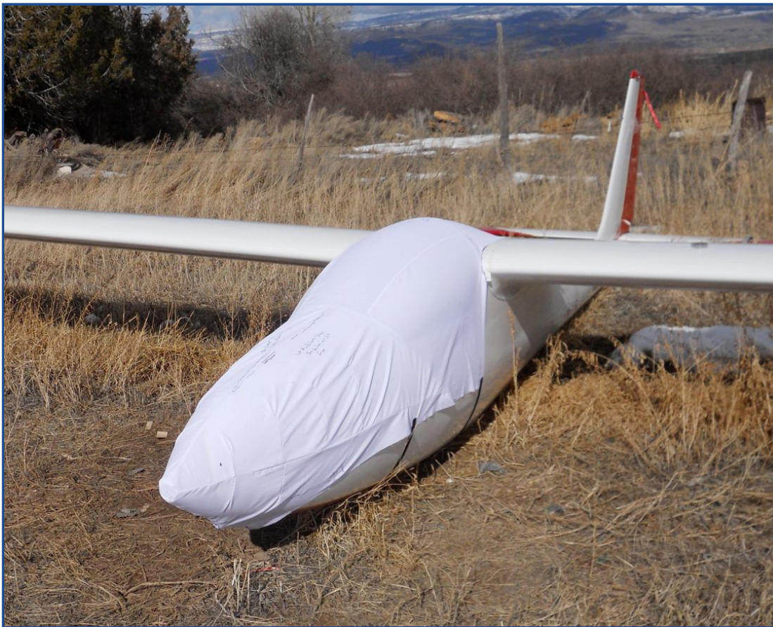
Laister LP-49 Canopy/Nose Cover, test fit cover