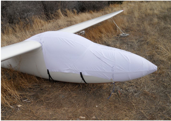
Laister LP-49 Canopy/Nose Cover, test fit cover

water resistance, UV resistance and anti-static buildup. The inner lining is a very soft and smooth microfiber to prevent scratching. The material is very reflective, and tests show that the cabin interior temperature can be reduced to near-ambient temperature on the hottest of days. It is water, ice and snow repellent, yet breathable to allow moisture to escape from between the cover and the aircraft surface.