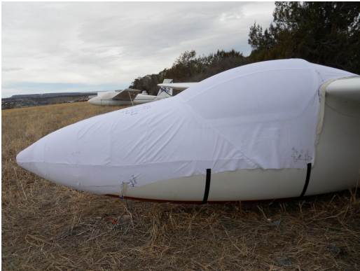
Laister LP-49 Canopy/Nose Cover, test fit cover