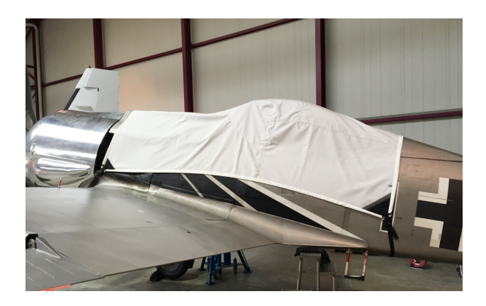
Focke Wulf 190 Canopy Cover