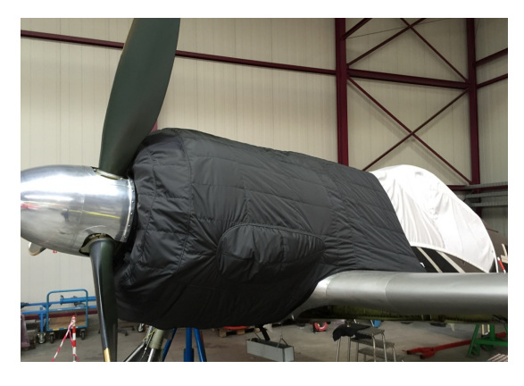
Focke Wulf 190 Canopy Cover & Insulated Engine Cover